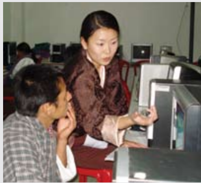
JICA Volunteers in Bhutan

Twenty years later a total of 373 volunteers (291 JOCVs and 82 Senior Volunteers) have been dispatched to contribute to the exchange of friendship and the development of the Kingdom in various fields: Agriculture, Environment, Community Development, Education, Sports, Health, Architecture and Civil Engineering, Cultural Properties Protection, Independence of People with Disabilities, Vocational Training, and Engineering (Mechanical and IT).