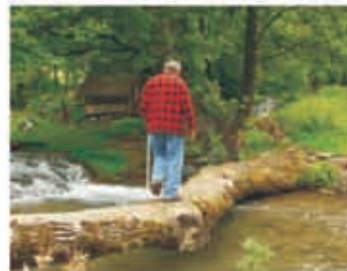
Forest walking at the Janj's Islands

Professional sportsmen will surely find something to suit themselves, along with just average tourists of all ages all-year round.