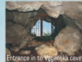
Entrance in to Vaganska cave

cave is »Sokolačka« which is located nearby medieval town Sokograd. It is hard to approach, which is the reason why this cave is untouched and conserved all the time. The rich and nature look of this cave is well known wide abroad.