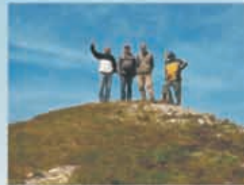
1906 m above sea level

All tracks are adapted for all these activities. Valleys around the river Pliva bend, gentle, rolling hills around Sokocnica and Janja canyons and at the end, a real mountain expeditions to Vitorog are representing a real treat for all lovers of active vacations. With all those commodities, experienced guides are available for all destinations, as well as various equipment needed for these activities.