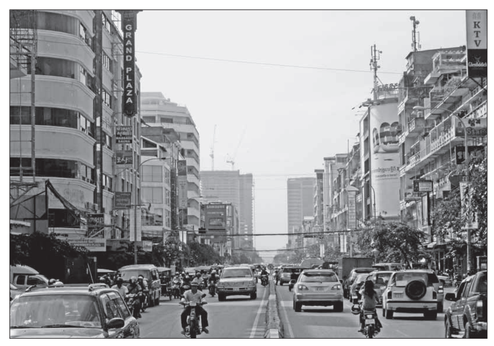
A street in Phnom Penh