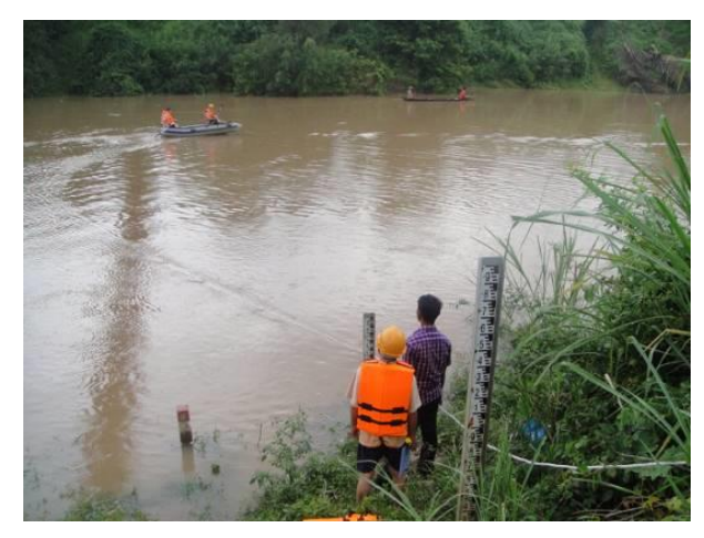
Water Discharge Measurement

Agriculture is the prime industry in Cambodia which agricultural production contributed to approximately 36% of the country's GDP in 2010 and agricultural and rural development is one of the priority development area for poverty reduction and national economic development in Cambodia. But agricultural field faces