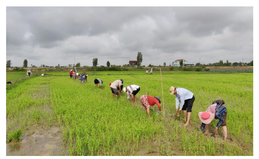
Rice Field Demonstration

Strengthening the supply chain of rice to bear the global competition and rice production dynamics in the Cambodian rice sector.