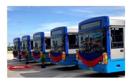
Japanese buses which were donated to Phnom Penh. Cambodia in 2017

In 2011, in Vientiane, Laos, besides the provision of large buses, we launched a project focusing on the improvement of bus operations. With the strengthening of the operation system of the public bus corporation, we succeeded in improving the balance of city's bus business by optimizing the operation timetable, route plan, and fare system.