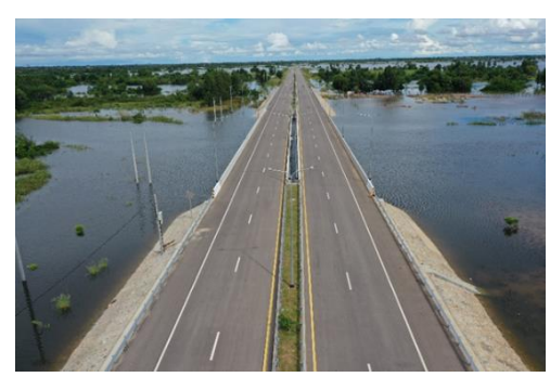
National Road No.5

The National Road No.5 Improvement Project is a concessional loan project with loan amount approximately US$ 720 million till date. The project contributes to increasing the volume of traffic on National Road No.5, which is a major route in Cambodia connecting Phnom Penh to Thailand, and further promote economic development in the Kingdom through trade promotion with neighboring country as well as strengthen connectivity throughout the region.