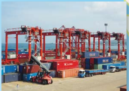
Sihanouville Port Urgent Rehabilitation Project (YL: ¥4,142mil. '99) Sihanouville Port Urgent Expansion Project (YL: ¥4,313mil. '04) Sihanouville Port Special Economic Zone Development Project (YL: ¥3,651mil. '08) Sihanouville Port Multipurpose Terminal Development Project (YL: ¥7,176mil. '09)