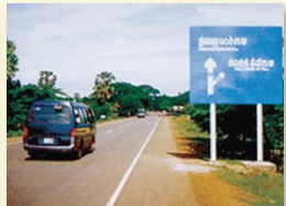
The Project for Improvement of National Road No.7 (Kampong Cham Section) (GA: ¥1,975mil. '01) 10.2km The Project for Rehabilitation of National Roads No.6, 7 (GA: ¥4,578mil. '97)