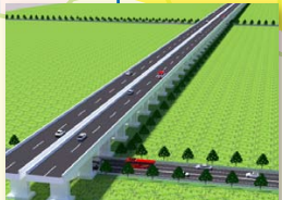
Phnom Penh - Bavet Expressway Development Project (Under Feasibility Study)

Notes GA: Grant Aid YL: Yen Loan Number: Settled Year for GA/YL ● Major Cities ■ National Roads — Completed — Under Construction — Under Feasibility Study