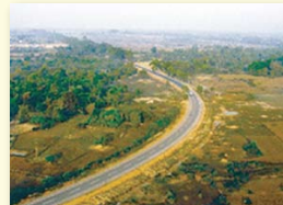
The Project for Improvement of National Road No.6 (Siem Reap Section) (GA: ¥1,307mil. '00) 17.4km