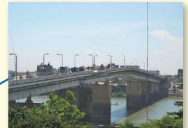
Restoration of the Chroy Changvar Bridge (Japan Bridge) (GA: ¥2,989mil. '92, '93)