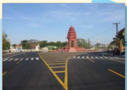
Project for Flood Disaster Rehabilitation and Mitigation (GA: ¥1,510mil. '12)