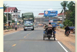
The Project for Improvement of the National Road No.1 (I-IV) (GA: ¥9,373mil. '05, '06, '09, '13, '14) 56.0km