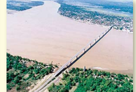
The Project for Construction of a Bridge over the Mekong River (Kizuna Bridge) (GA: ¥6,382mil. '97)