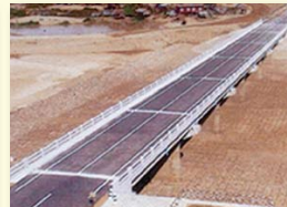
The Project for Improvement of Bridges on National Road No.6A (GA: ¥1,359mil. '00) The Project for Rehabilitation of National Road No.6A (GA: ¥3,012mil. '93) 44.5km