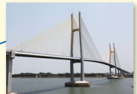
The Project for Construction of Neak Loeung Bridge (GA: ¥11,940mil. '10)