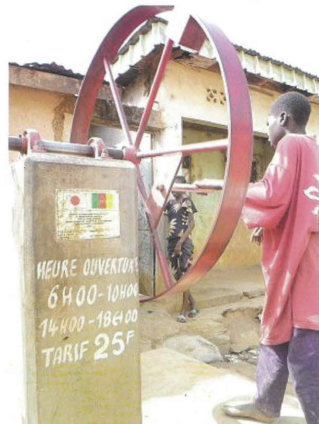
Deep well & pump built by Grant aid

For a better tomorrow for all Japan International Cooperation Agency