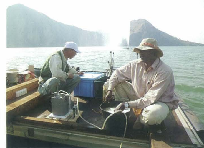
Japanese and Cameroonian researchers taking data at Lake Nyos