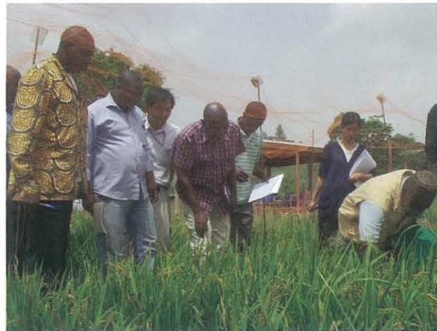
Training for trainers on NERICA (New Rice for Africa) production

Ameliorate living environments of the rural community through improving the access to water and supporting community development aiming to improve social status of rural villages.