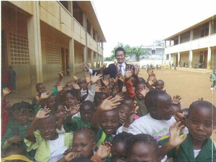
Primary school built by Grant aid and a JOCV teacher working in it