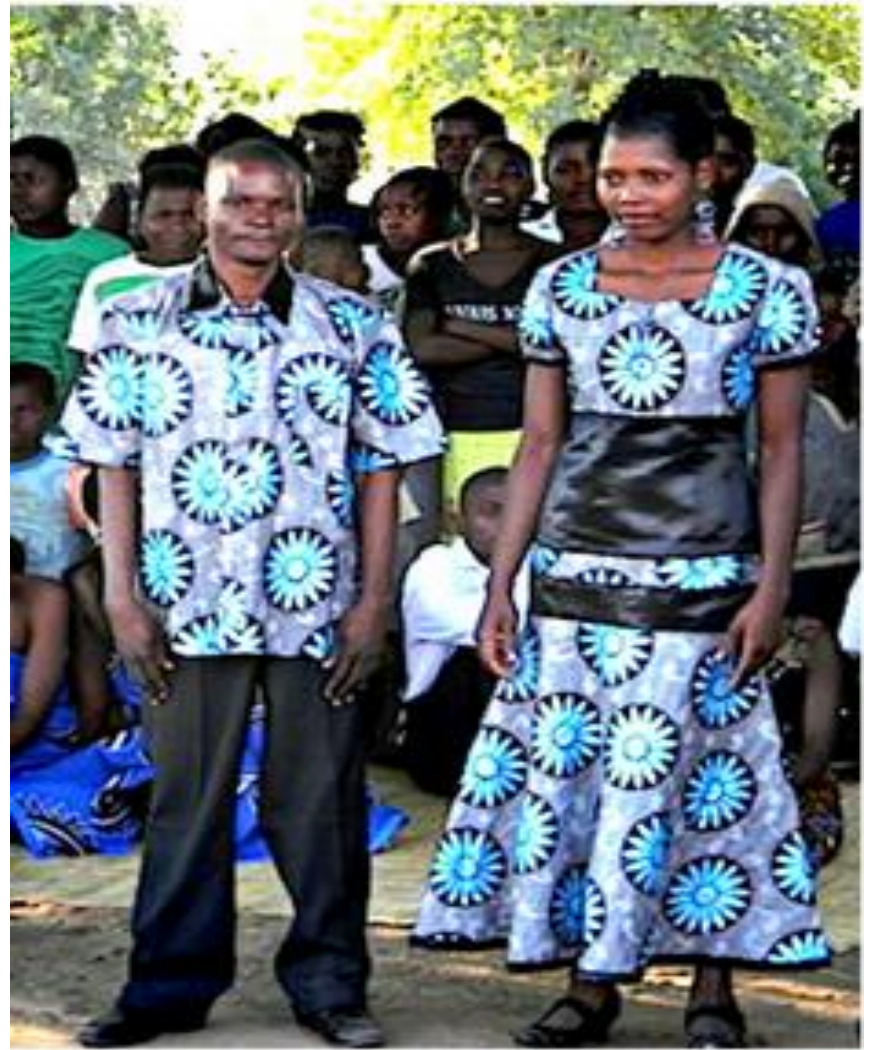
A Malawian Wedding