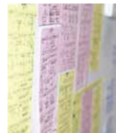
Wall of her room, filled with notes for memorization, symbolizes her diligence