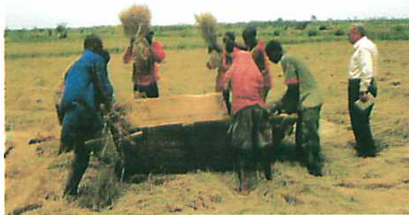
Director of Rice Technology Training Center observing farmers threshing rice in a field in Ghana.

Based on these recommendations, the courses implemented during 2007 witnessed change in strategy of accepting participants where bigger number from the same country were selected rather than expanding the accepted participants horizontally to cover a wide spectrum of countries. Also during the formulation process the invited countries were selected according to the priority given to the field the training is addressing in JICA policy towards that country.