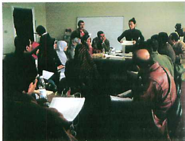
Japanese Expert with Egyptian participants in the workshop

Japan International Cooperation Agency [JICA] organized in collaboration with conservation center of Grand Egyptian Museum a workshop on Paper Conservation in the period from Feb,24 to Feb,28, 2008 at the premises of the new project site.