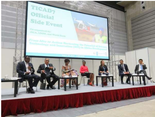
A joint side event with WB and UNDP was held at TICAD 7 under the theme of From Idea to Action: Harnessing the Potential of Science, Technology and Innovation (STI) in Africa Development