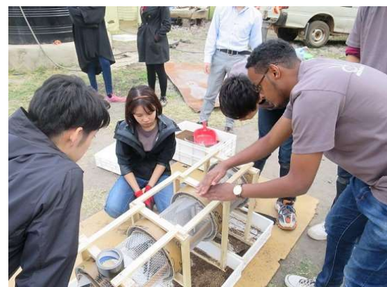
"JICA-Kosen Open Innovation Challenge" that utilizes manufacturing skills of technical school students in Japan to solve social issues in Africa.