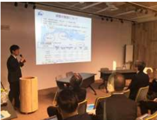
Seminars were held as part of a study on open innovation using digital technology in Africa.