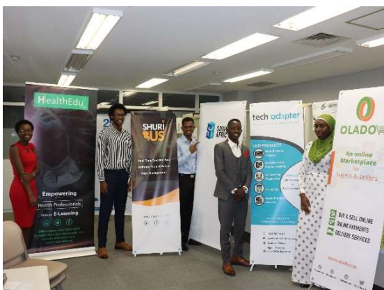
Conducted surveys that led to new DX such as ICT Technical Cooperation in Rwanda and survey on digitization of public services in Africa.