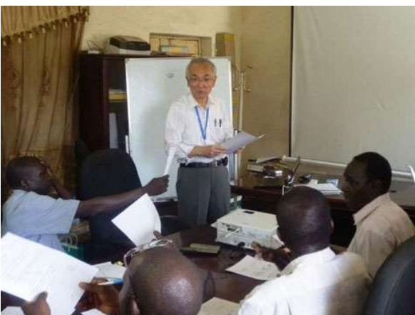
South Sudan: Technical training for staff in South Sudan Broadcasting Corporation