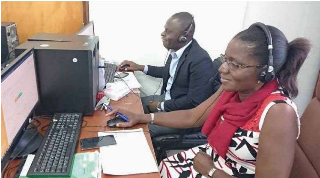
Cote D'Ivoire: The call center in Cote D'Ivoire receiving inquiries on legal matters