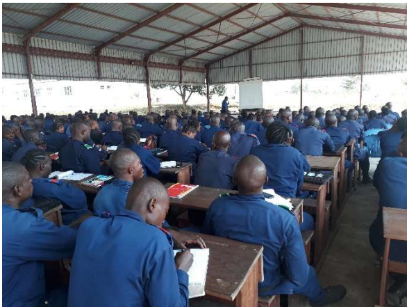
DRC: DRC : Training on human rights for the national police in DRC