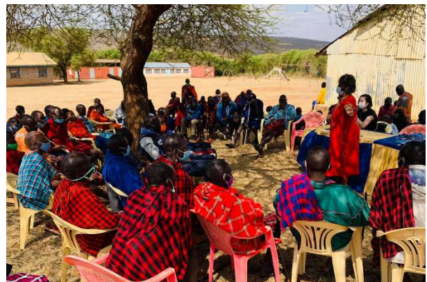
Kenya: The awareness raising session against FGM was conducted as part of data collection survey on GBV.