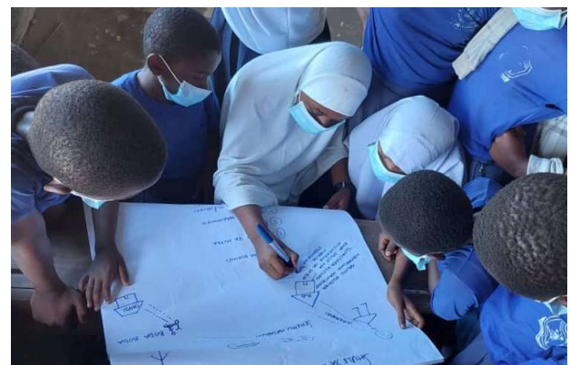
Tanzania: The pilot activities to strengthen protection mechanisms for GBV survivors in the community was conducted as part of data collection survey on GBV.