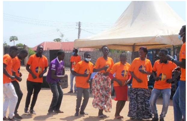
South Sudan: Event celebrating the International Day for the Elimination of Violence against Women in 2021, supported by the advisor for protection and rehabilitation/reintegration of GBV survivors.