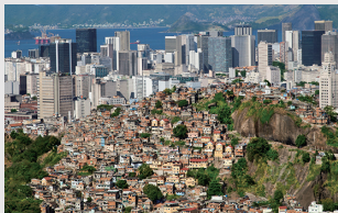
Disparities in Livelihoods

Rio de Janeiro stands out for the difference between slums and skyscrapers