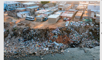
Solid waste problem

Traffic congestion in India. Convenience is compromised and the air is polluted.