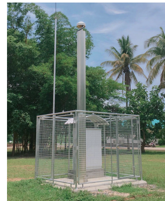
A satellite-based continuous observation reference station in Thailand. It houses antennas, receivers, and communications equipment that receive satellite signals.

In Thailand, since the satellite-based continuous observation reference station networks required for the development of G-spatial Information was established by multiple government agencies, the system was not unified nor comprehensively operated by the government. Therefore, JICA started cooperation to integrate 240 satellite-based continuous observation reference stations in Thailand from 2020 to ensure stable operation of high-precision positioning services through the data center. In the future, highly accurate real-time positioning service will be usable throughout the entire country, and it is expected to be used for remote operation of agricultural and construction machinery and for automatic driving.