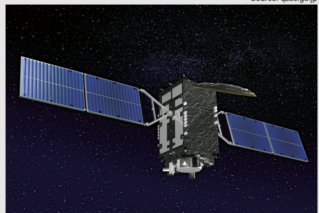
We utilize the highly accurate location data service provided by Japan's Quasi-Zenith Satellite System MICHIBIKI, compatible with the U.S. GPS (Global Positioning System).