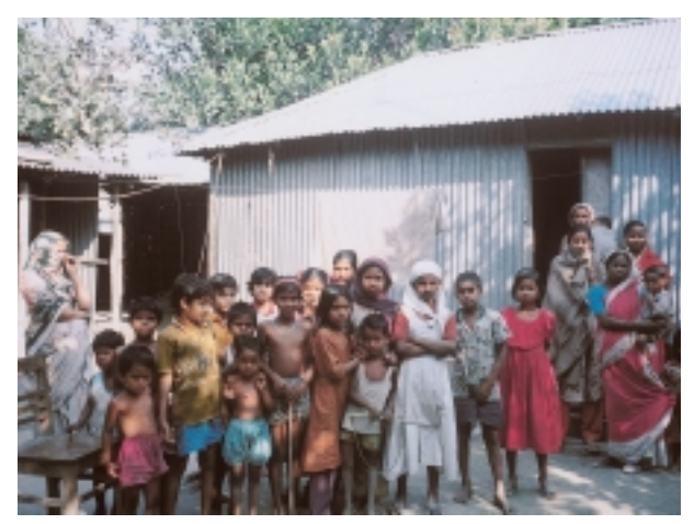
Settlers in the Resettlement Site