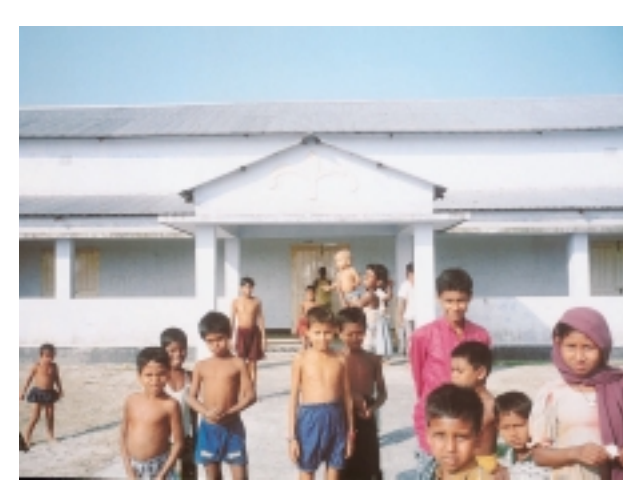
A Community Center Built in the Resettlement Site