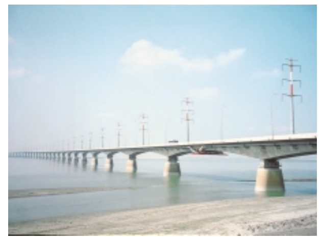
Jamuna Multipurpose Bridge

A general impression which emerges from the qualitative survey is that the role of the NGOs have been more of a technical partner nature than a social mobilizational one. While some of the PAPs voiced the issue of accessibility of the NGOs to common PAPs, NGOs like BRAC on their part explained that their distance from the PAPs was necessary to avoid getting embroiled in local politics particularly in the sensitive issue of listing of PAPs for EFAP payments.