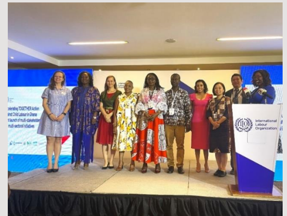
Launch event confirming collaboration with the Ghanaian government and development partners

Sectoral Action for the Elimination of Child Labor