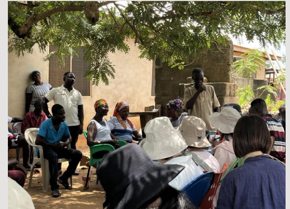
Ghana Study Tour organized by Platform

JICA is providing technical cooperation in the cocoa industry, where child labor is common, particularly in Ghana, which produces more than 70% of the cocoa beans imported by Japan. In order to contribute to “eliminate all forms of child labor by 2025” (SDG 8.7), JICA is working to identify model activities and strengthen cooperation among related parties to certify areas where child labor is eliminated. In addition, the Sustainable Cacao Platform in Developing Countries was established to address issues throughout the supply chain. Providing opportunities for co-creation through study tours, breakout sessions, etc. .