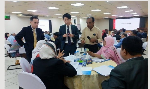
Mediation seminar held in Dhaka City in November 2024.

Ensuring opportunities for judicial redress for people, including socially vulnerable groups, is also linked to human security, protecting people's livelihoods and dignity.