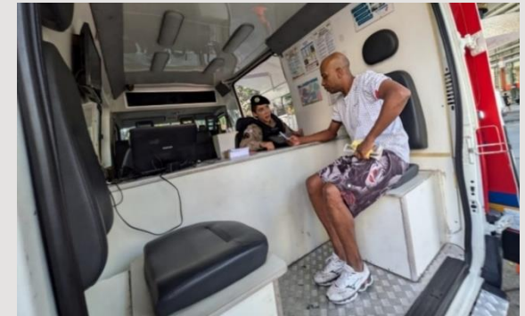
Mobile police box

Based on the experiences and results in Brazil, JICA supports the introduction of local police from Brazil to other countries in the Latin American region (e.g., Honduras, Guatemala, Colombia).