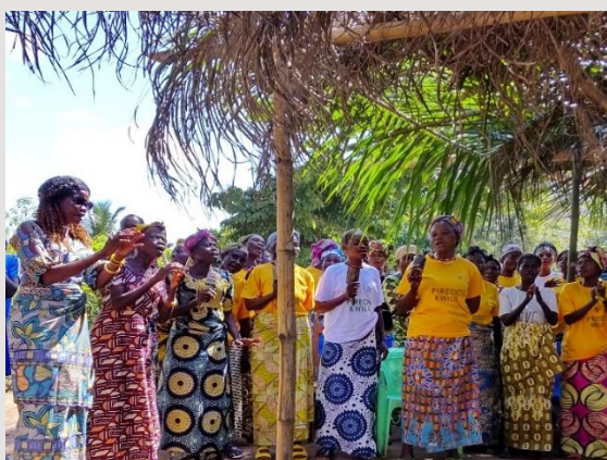
Women's group plays a central role in agroforestry activities, carrying out forest conservation efforts across 270 villages in the Democratic Republic of the Congo