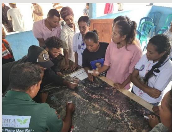
Local community actively participating in discussions about land use, Timor-Leste