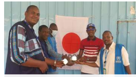
Lanterns to the health center at refugee camp in Sayam Forage