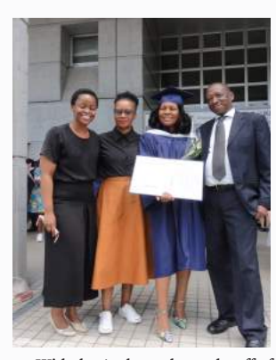
With the Ambassador and staff of the Embassy of Botswana