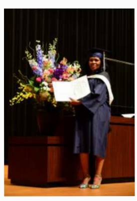
Received her diploma

*Botswana Government under the Directorate of Public Service Management, which is an HR Agency of the public service