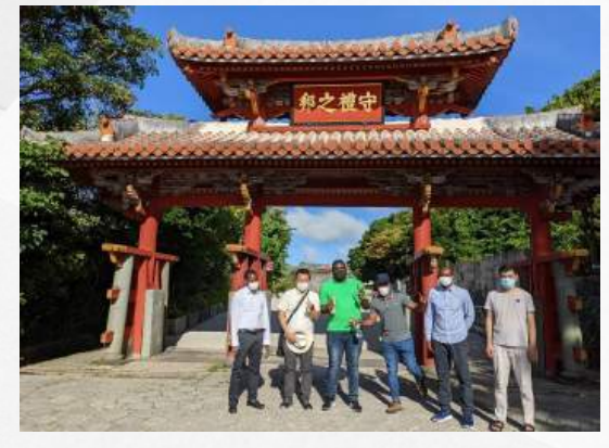
Shurijo Castle Shureimon Gate (the Ryukyu University once existed at the Shurijo Castle ruins)