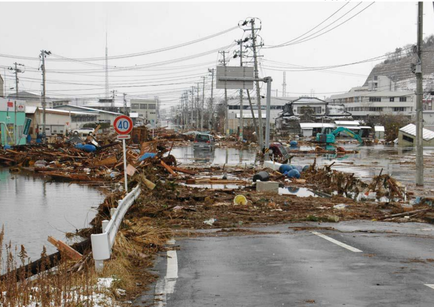
Tsunami damage in Ono district