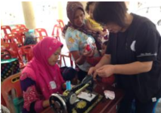
Community business workshop in Banda Aceh