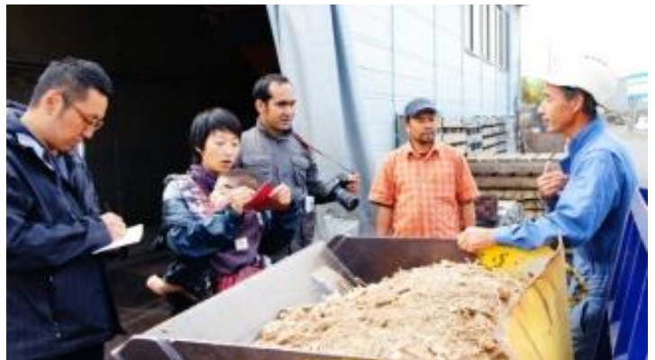
Learning how to recycle market waste