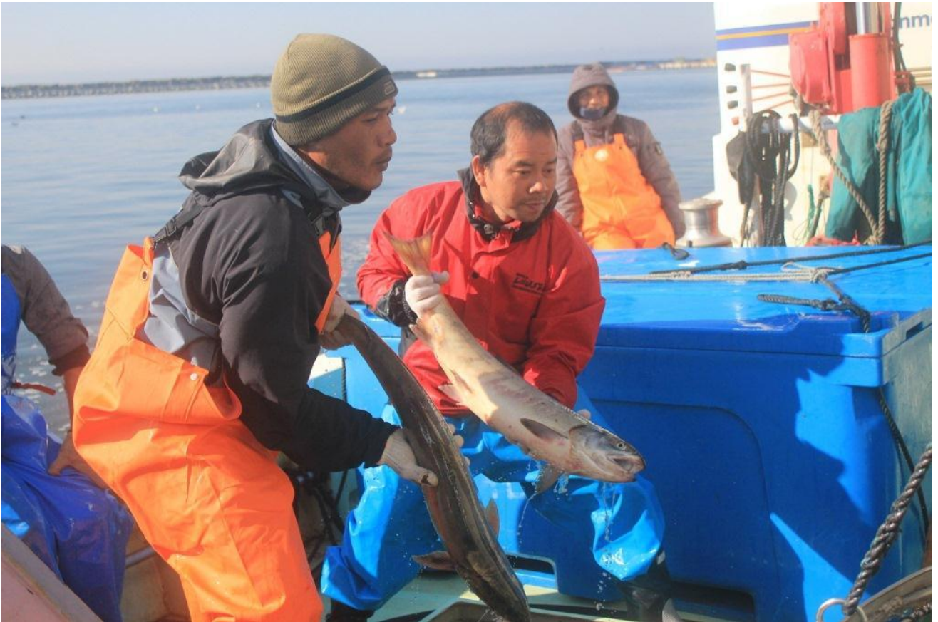
On a fishing boat with local fishermen

Higashimatsushima partners with Banda Aceh in Indonesia through the JICA Partnership Program (JPP) in its effort to achieve full recovery from the 311 tsunami. Banda Aceh has also experienced devastating damages from the Indian Ocean earthquake and tsunami of 2004. The two cities strive together to rebuild and establish natural disaster resilient communities. With aid from HOPE, the two cities provide training opportunities for its staff to exchange ideas related to community disaster preparedness, business models utilizing local resources, and organizing effective public administration systems. In addition, the city facilitates community meetings to discuss new ideas such as “blue tourism (basket fishing and tourism)” and “organic waste recycling and production of farmed cat fish food.” These new ideas are created during meetings with community leaders, fishermen, and experts in waste management, and are already being practiced as model programs, to revitalize the local economy.