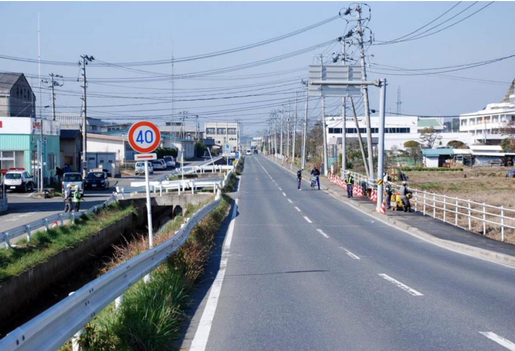
Ono district of Higashimatsushima after recovery