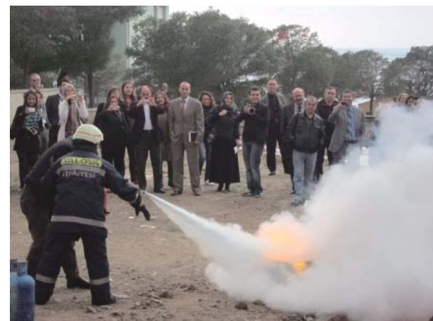
A wide range of activities are included in disaster-response training, like this demonstration in putting out fires.