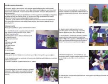
Children learn about disaster prevention through relevant topics, such as this experiment on preventing flood erosion.