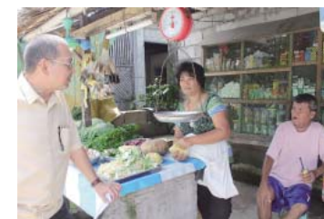
A couple living and selling vegetables along Makoto Migita Street. They say life is easier now that they do not have to worry about floods.

Leyte once again found itself in the path of the storm. In the city of Ormoc, 37 people died and 8 went missing—significantly lower numbers compared to the 1991 typhoon. The most severe destruction occurred in Tacloban, the largest city on Leyte's eastern coast. The powerful storm caused massive tidal waves five to six meters in height, inflicting catastrophic damage on the city. JICA once again set about providing needed support.