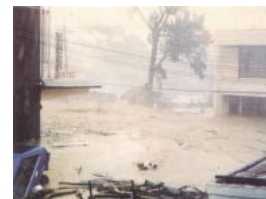
Flooding in Ormoc in 1991 caused by Tropical Storm Thelma (above). The Pasig River on the outskirts of Manila, where work by Japan on the banks has reduced damage from flooding (right).

Following the disaster, the city carried out restoration work, repairing damaged dikes and replacing destroyed bridges. The local government lacked fi-