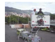
Training in how to safely approach a building with a platform truck.