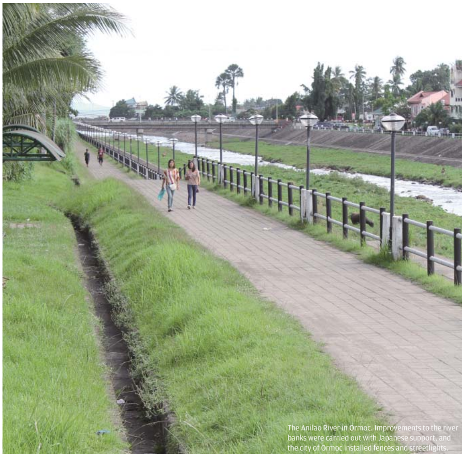
The Anilao River in Ormoc. Improvements to the river banks were carried out with Japanese support, and the city of Ormoc installed fences and streetlights.