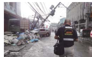
A debris-strewn street in Tacloban, November 12, 2013.

In order to share Japan's recent reconstruction experience with the Philippines, JICA asked the city of Higashi Matsushima in Miyagi Prefecture, which endured the Great East Japan Earthquake and its aftermath, to present its relevant experiences. Two city employees and two private personnel from Higashi Matsushima, which is now carrying out its own recovery plan, joined the survey team. JICA's aim is to enable people in the typhoon-ravaged regions to learn from the more accessible experience of a rural community working to recover from disaster. As a leading nation in disaster management, Japan has much to offer to Philippine communities seeking to build a more resilient, secure future.