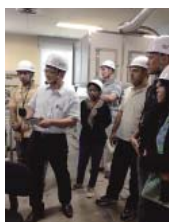
Trainees learn about fire prevention at the International Institute of Seismology and Earthquake Engineering in Tsukuba.

The trainees return to their homelands with lessons learned about Japanese technology to protect buildings and other structures in the event of an earthquake, tsunami, or fire. Japan's knowledge is now being put to use in this way to save lives and property all around the world.