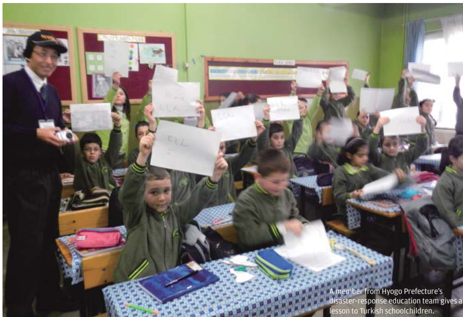
A member from Hyogo Prefecture's disaster-response education team gives a lesson to Turkish schoolchildren.