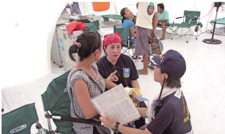
Members of the Japan Disaster Relief medical team providing treatment in the Philippines.