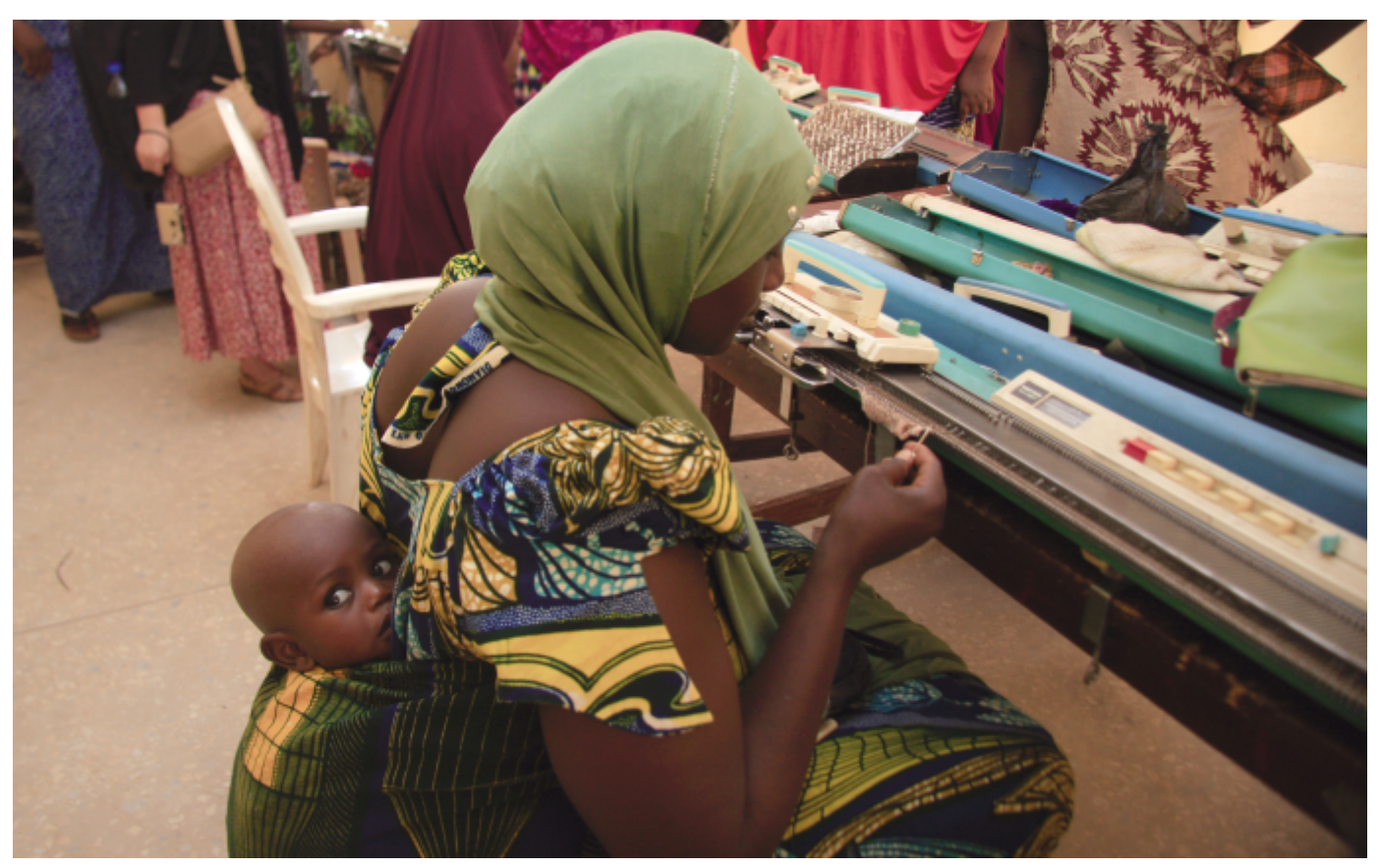
A mother carries her child on her back as she attends a knitting class. Women Development Centers make it possible for mothers to take courses while looking after their children.