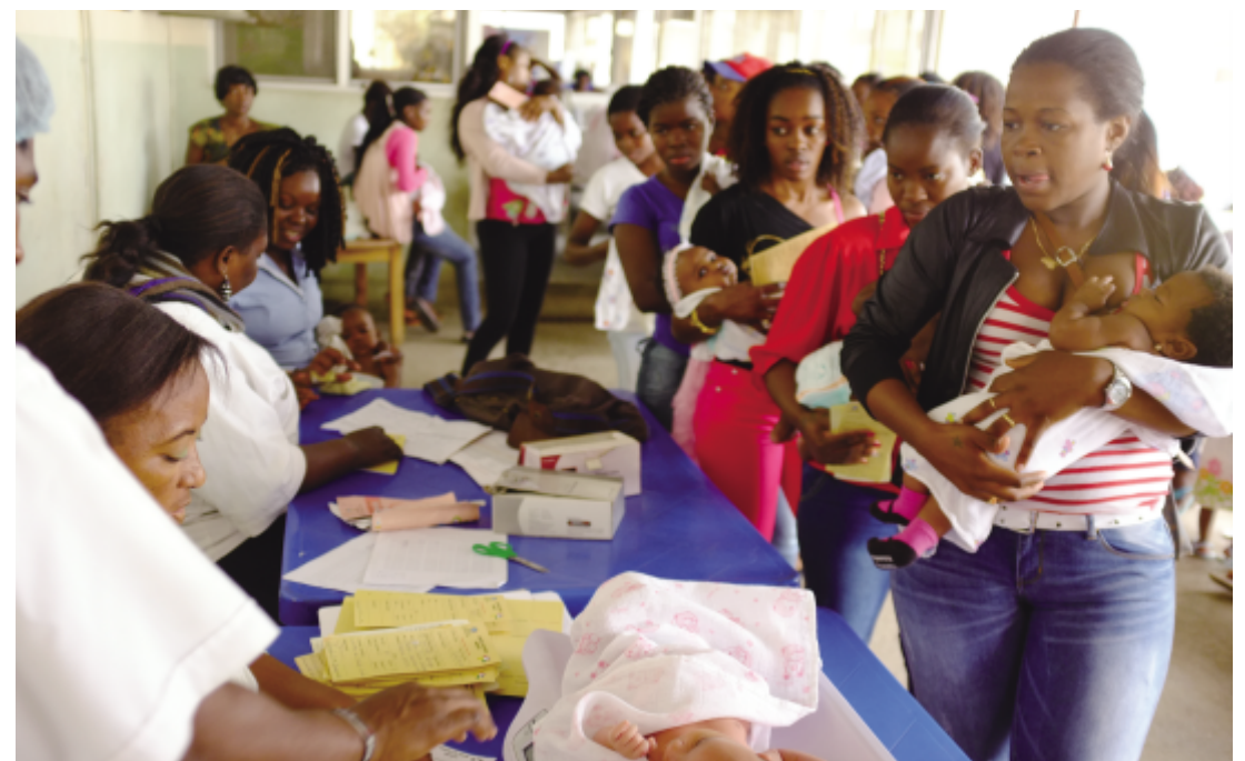
Mothers line up to have their children immunized (above). Committee members discuss the content of the maternal and child health handbook.