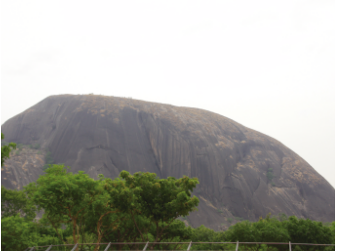
The striking golden dome of the Abuja National Mosque (left) and majestic Aso Rock, Abuja, Nigeria.

the standard of living of women, but the centers faced uncertainty after President Babangida stepped down from power in August 1993. Unable to secure appropriate funds under consecutive governments, WDCs around the country became moribund. By the end of the 1990s most had ceased to function adequately.