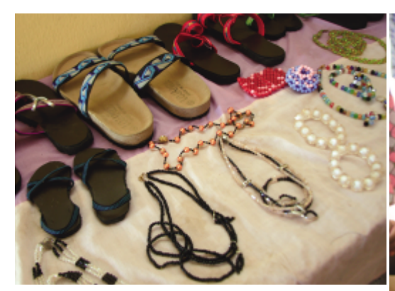
Sandals and accessories crafted by students at a WDC. Centers provide new skills to help women.