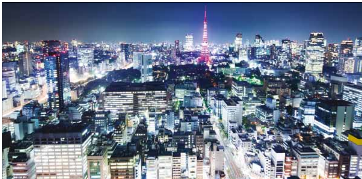
JICA: World's largest bilateral aid agency is Japan's ODA financing powerhouse in the emerging world

boost infrastructure investment (especially in Asia), to help green initiatives such as climate change and forestry, and to boost relationships between NGOs and Japanese companies operating in or seeking to operate in the emerging economies.