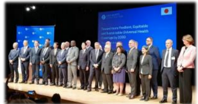
Picture of High-levels guests at UNGA High-level Meeting 2023