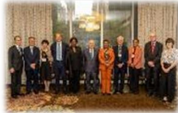
UNGA side event (Sep '24)