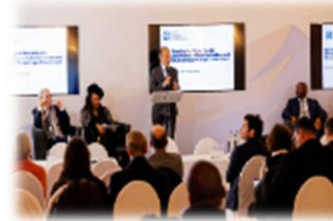
WEF side event (Jan '25)