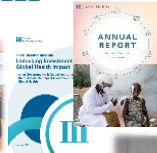
WHA side Event (May '25)