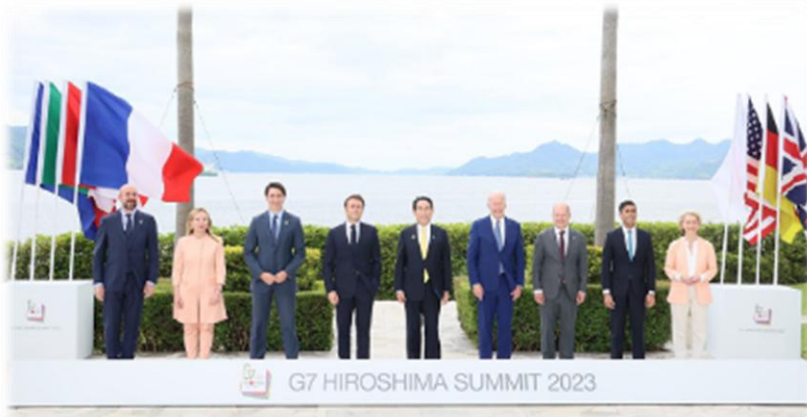
Picture of G7 countries leaders at G7 Hiroshima Summit 2023