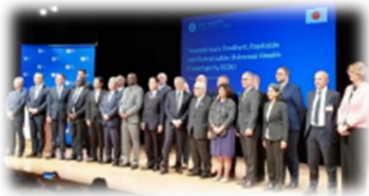
The initiative was launched during UNGA 2023