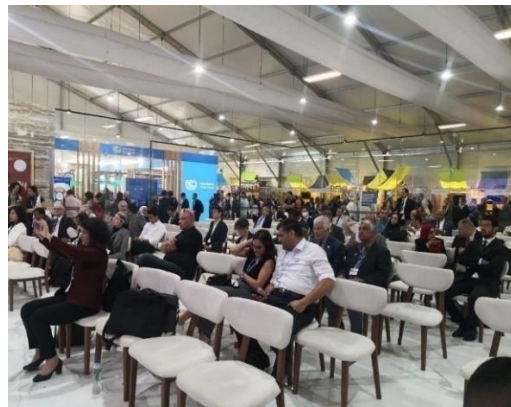
Audience attending the side event