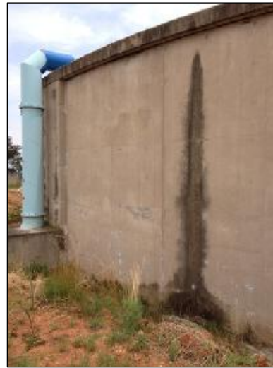
Ekangala Regulating Reservoir Minor leakage can be seen