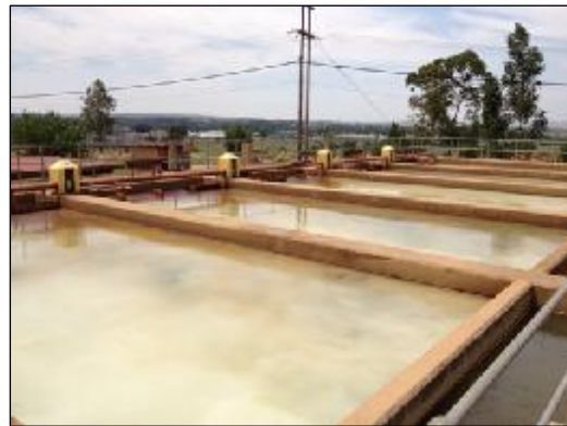
Bronkhorstspruit Water Purification Plant