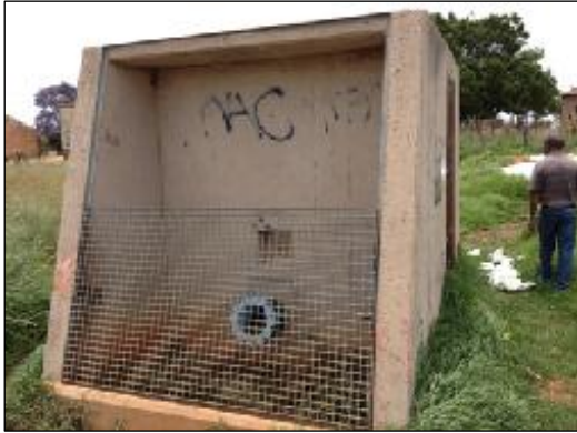
Ekangala-Enkeldoornoog Aqueduct facility