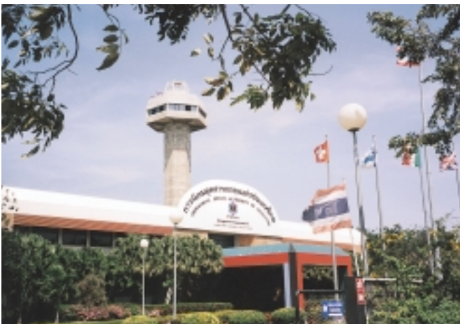
Offices of Industrial Estate Authority of Thailand, the executing agency

By implementing Eastern Seaboard Development Plan, the Eastern Seaboard achieved a rapid economic growth. From 1991 through 1996, the real GNP per capita for all of Thailand achieved an annual average growth rate of 6.6%, but the real GNP per capita for the Eastern Seaboard and Chonburi Province exceeded that of Thailand remarkably, achieving annual average growth rates of 11.7% and 10.9% respectively. Furthermore, looking at the value added of manufacturing, Chonburi Province grew at a rate twice that of the nation. The value added of manufacturing by said province occupies as much as 11.3% of that of the nation. Laem Chabang Industrial Estate is the main one among the five industrial Estates in Chonburi Province, so it can be said that it has played a major role in the industrialization of this province.