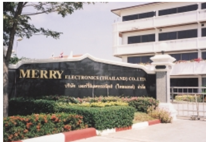
A Thai Plant in the Estate