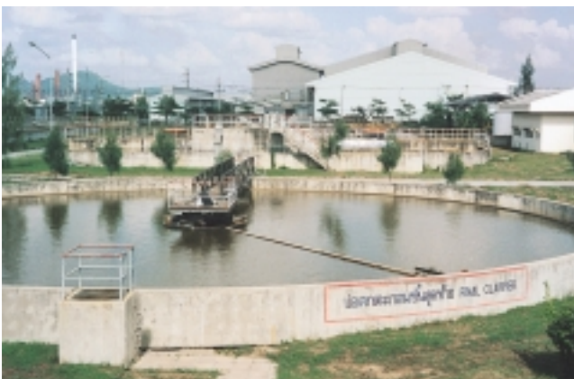
Sewage Treatment Plant in the Estate