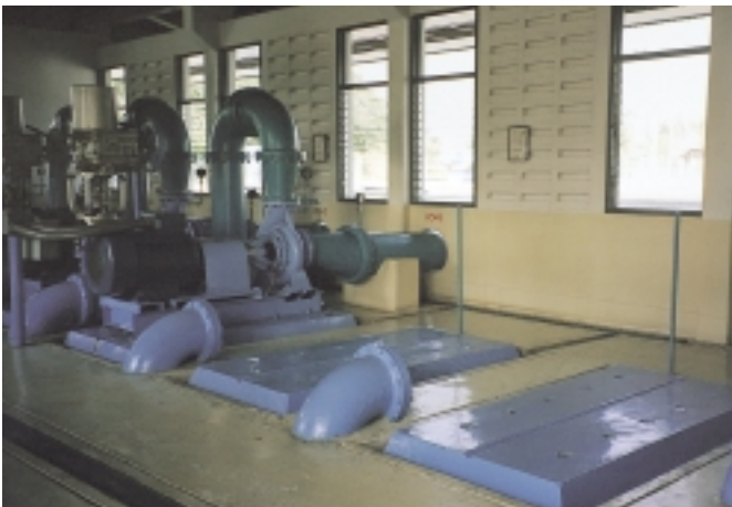
Pump Room in the Estate of East Water Company

Entrusting of the operations and maintenance for the water supply system to the private sector can lead to the efficient performance in the operation and maintenance system, if necessary preconditions are sufficiently met. These preconditions include the limitation of the contents of services entrusted, the initial arrangement of the business environment by the government, and so forth. Considering the importance of meeting these preconditions, it is necessary for the developing country's government and its executing agency to examine these preconditions sufficiently and then to determine what should be entrusted.