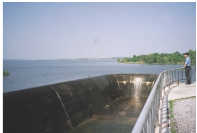
Nong Pla Lai Reservoir Spillway