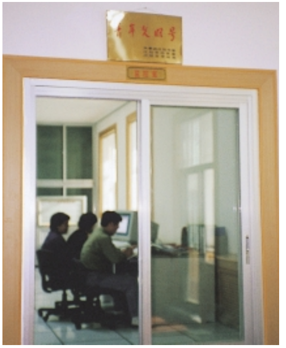
Shenyang Telegraph Office