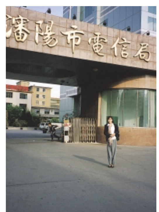
Shenyang Telegraph Office

FIRR of 12.11% was anticipated before this project was implemented. Actually, the cost underrun and the substantial increase in call capacity yielded by the introduction of SDH increased profitability, raising the FIRR to 52.14%.