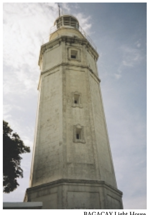
BAGACAY Light House