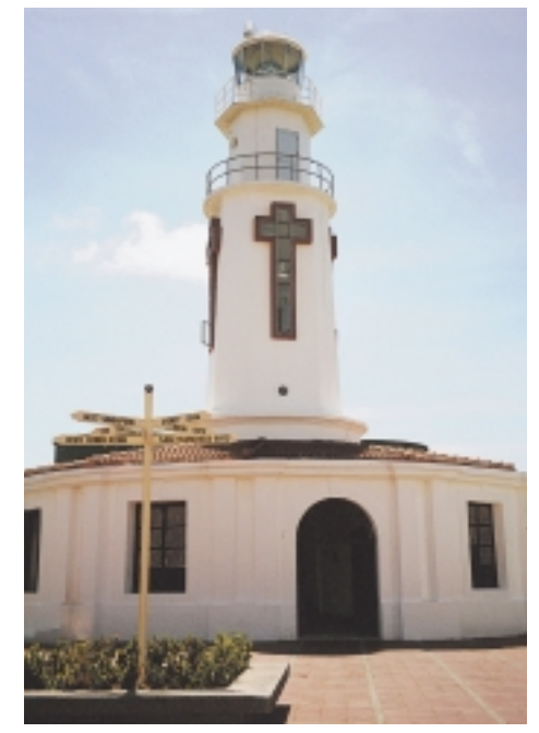
CORREGIDOR Light House

As a result of the engineering study performed as part of this project, plans for strengthening maritime safety, such as linking with Domestic Shipping Modernization Program and Maritime Safety Improvement Project (II) have been drafted in a short period of time and gone into implementation. While this is an indirect effect, this project can be said to have contributed to improving the safety of the maritime sector.