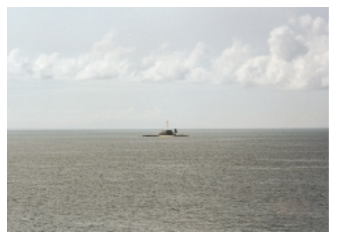
Light Beacon between Manila and Ceb Island