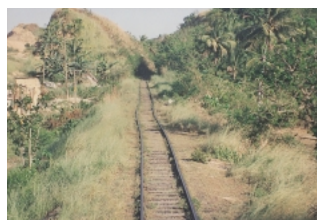
Railway Track(1993) before the Project : Implementation with Superannuated Ties and Bent Rails

Safety has been improved due to the reduction in derailments as mentioned above. In terms of improvements to service, the trains now operate with greater regularity, and vibrations on the trains have been reduced to provide more pleasant rides.