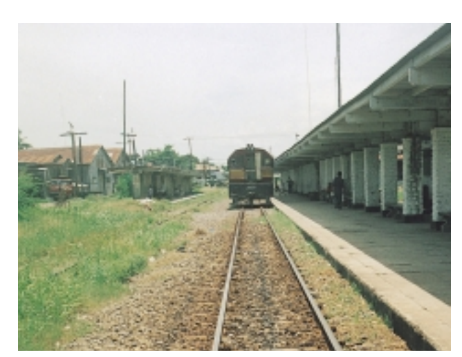
The Rehabilited Track after this Project