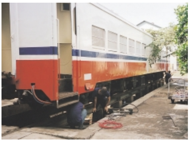
Rehabilition Works on a Passenger Coach