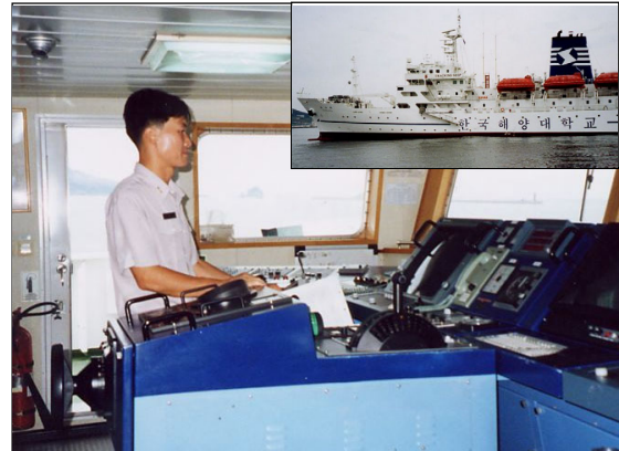
Site Photo: Training vessel "HANNARA" and equipment procured by the project