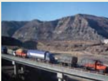
Shenfu Dongsheng Coalfield

One of the major state-owned companies in the coal industry in China, holding 35 companies under its umbrella. Established in 1995 with capital of 2.58 billion yuan (approx. 36.1 billion yen). It owns the Shenfu Dongsheng Coalfield (with a reserve of 223.6 billion tons), one of the largest in China, and engages in comprehensive development and operation of that coalfield as well as related businesses such as railway, power plants, ports and transportation.