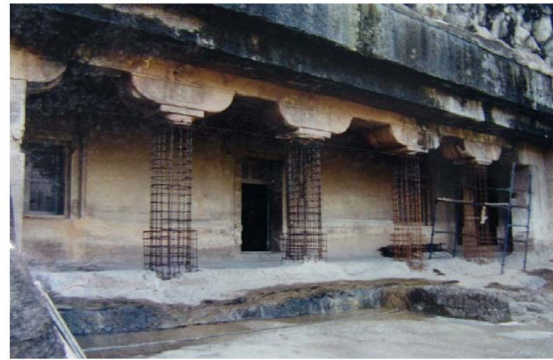
(Figure 29) Before reconstruction (left) and during reconstruction (right) of cave 21