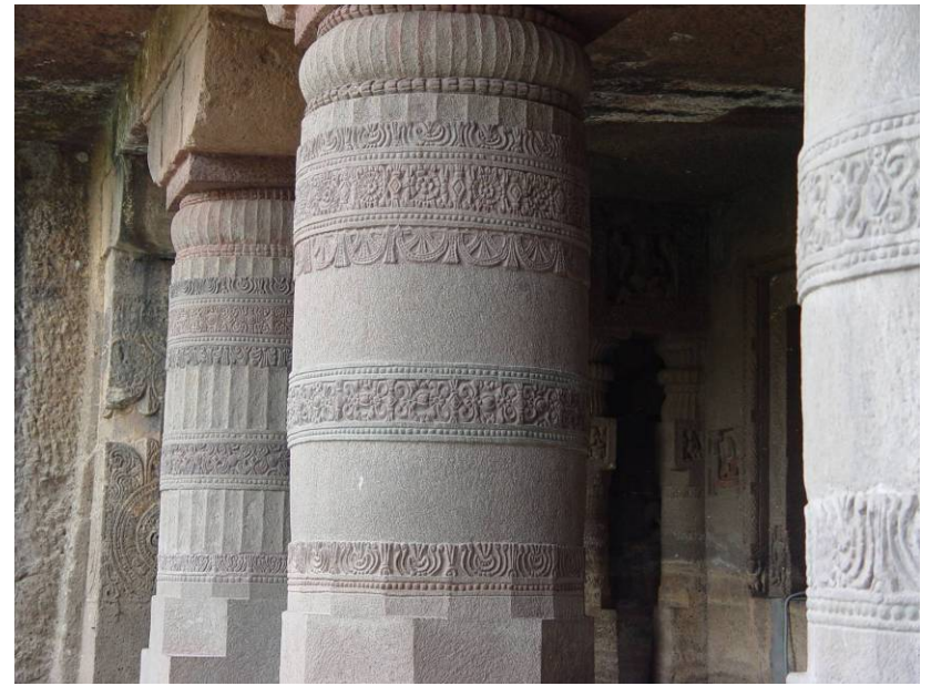
(Figure 28) Reconstructed facade at cave 21 (left) and detail of the colonnade (right)