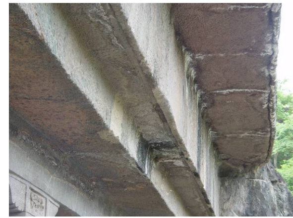
(Figure 32) Before reconstruction (left) and during reconstruction (right) and the reconstructed frieze at cave 23