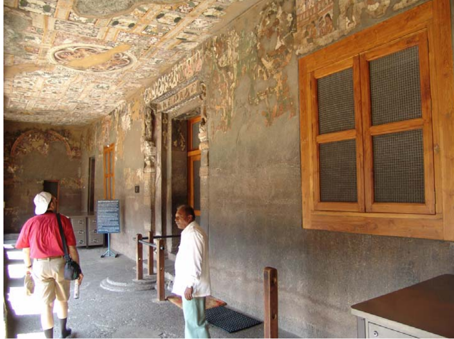
(Figure 34) Bat proof mesh at cave 17