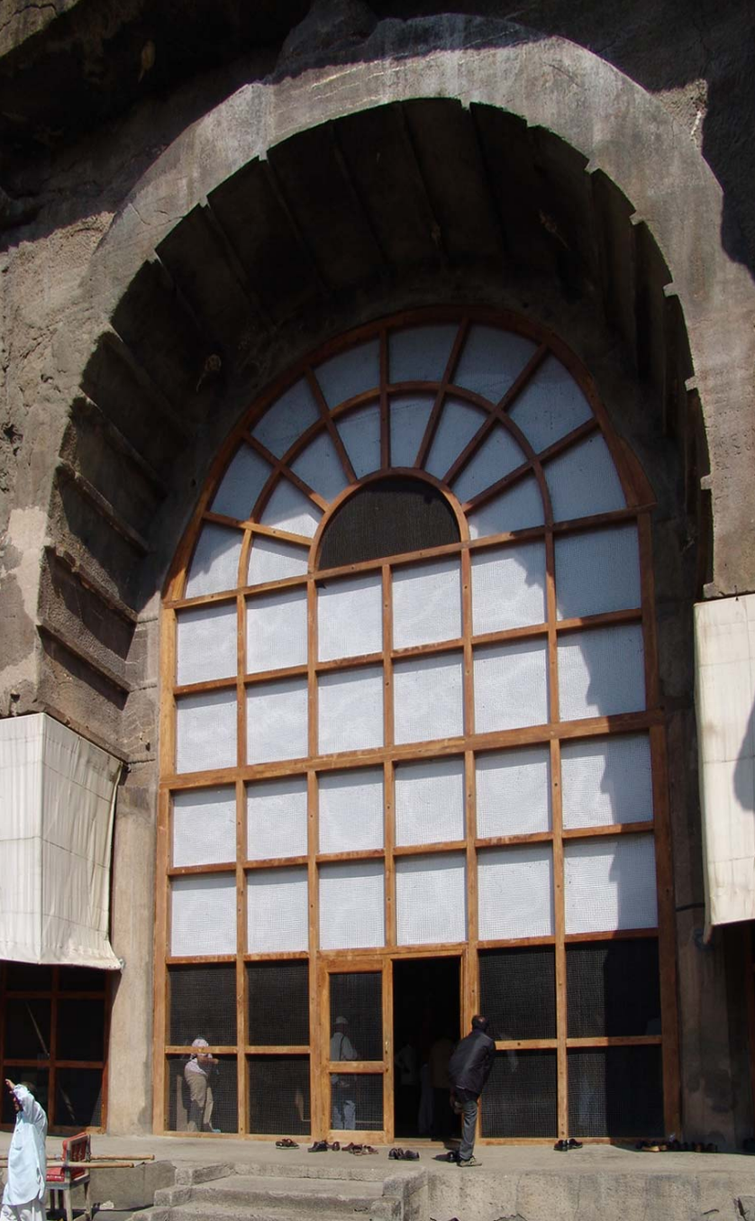
(Figure 33) Bat proof mesh at cave 10