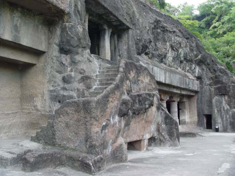
(Figure 30) Reconstructed facade of cave 22