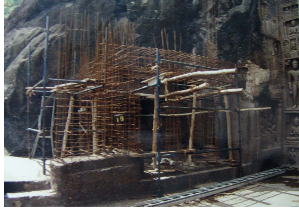
(Figure 26) Right shrine at cave 19 Before reconstruction (left) and during reconstruction (right)