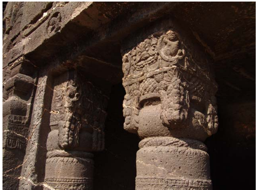
(Figure 27) Reconstructed column capitals (left) and original column capitals (right) in the right shrine at cave 19