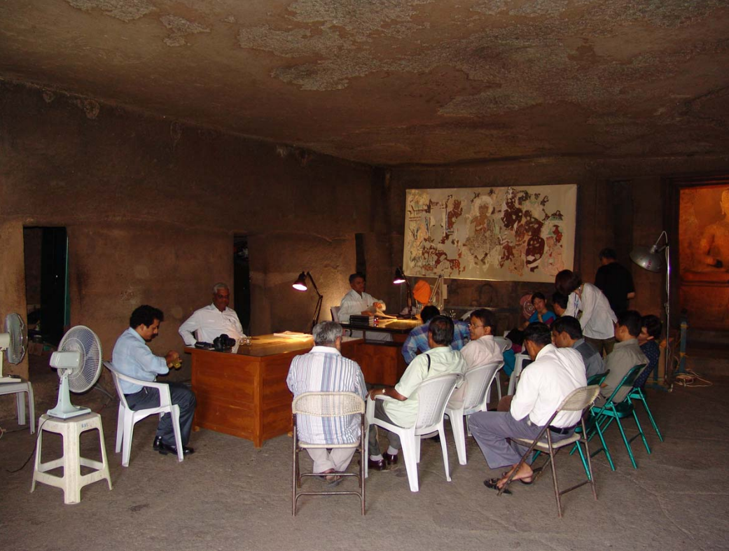
(Figure 36) Conservation and scientific research room set up inside cave 2