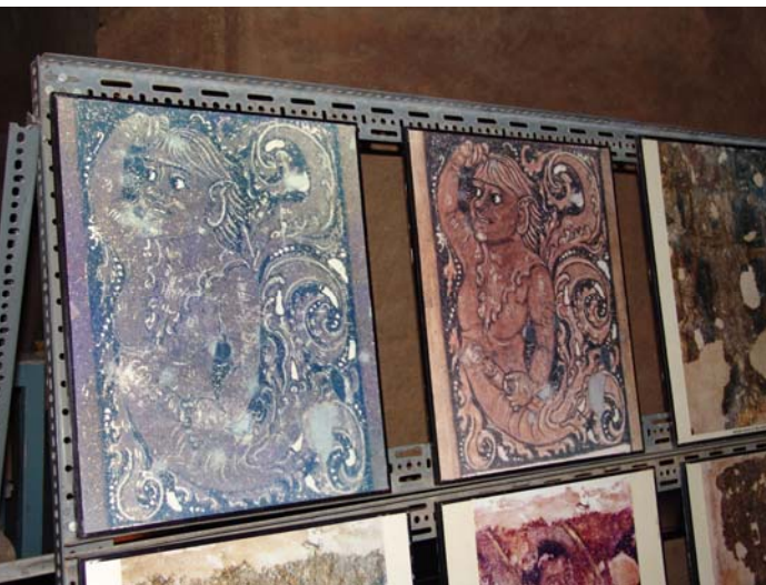
Model of the historic site, before and after photos of restoration of mural paintings (left), and samples of pigments (right) are displayed in the research room.