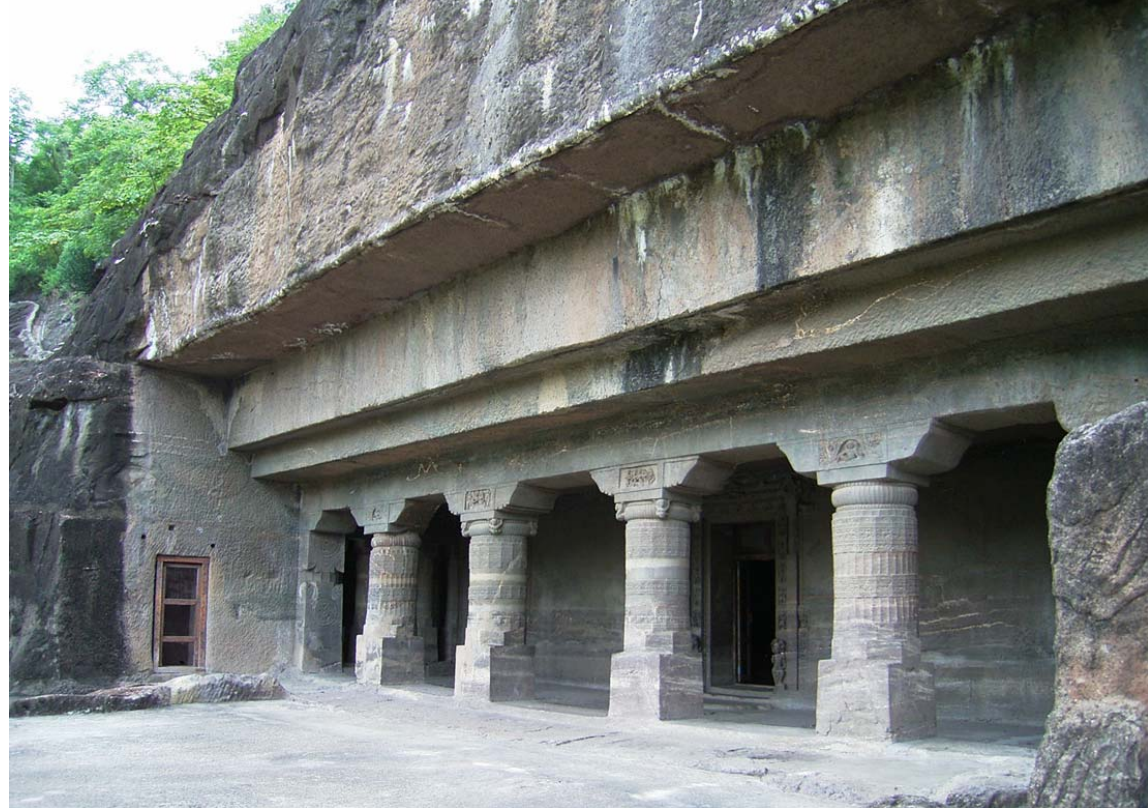
(Figure 31) Reconstructed facade of cave 23