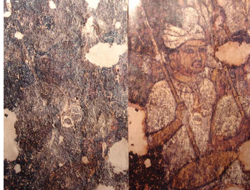
(Figure 37) Mural painting: before restoration (left) and after restoration (right)