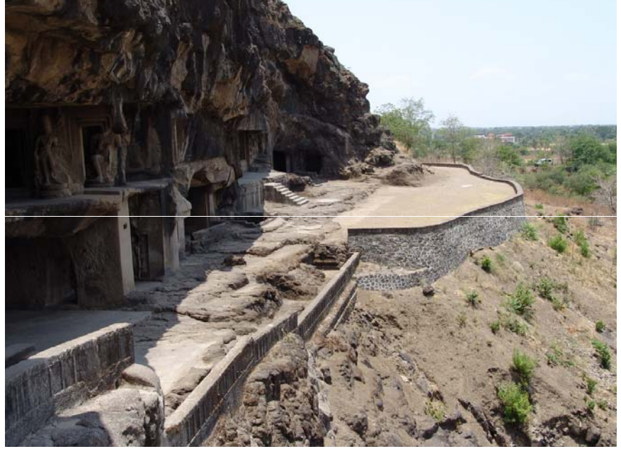
(Figure 45) Expanded pathway within the historic site (1) In front of caves 1-2 Before expansion (left) and after expansion (right)