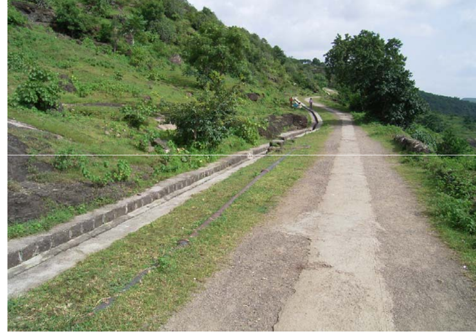
(Figure 49) Drainage maintenance work Above cave 16(left), drainage system carrying water from above cave 1 to side of cave 16