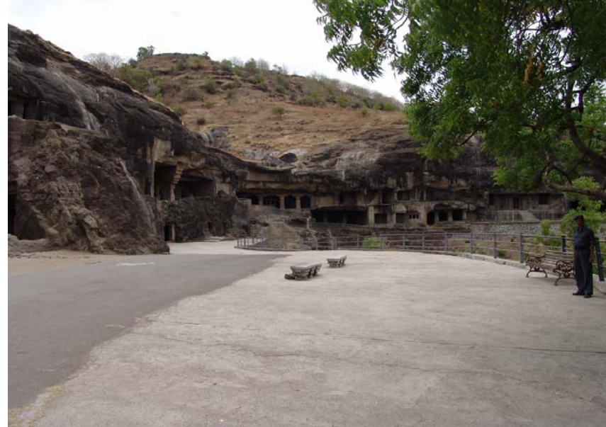
(Figure 48) Expanded pathway within the historic site (3) In front of cave 6-11