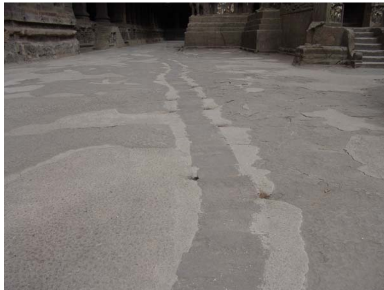
(Figure 50) Drainage maintenance work at cave 16 During work (left) and after completion (right)