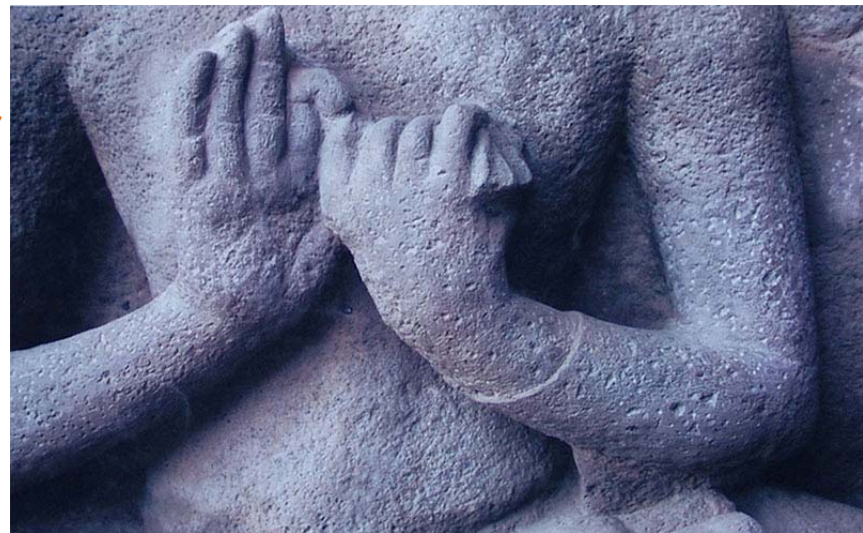
(Figure 57) Restoration and reconstruction of sculptures Cave 19 of Ajanta historic site

Before restoration (above) and after restoration (below)