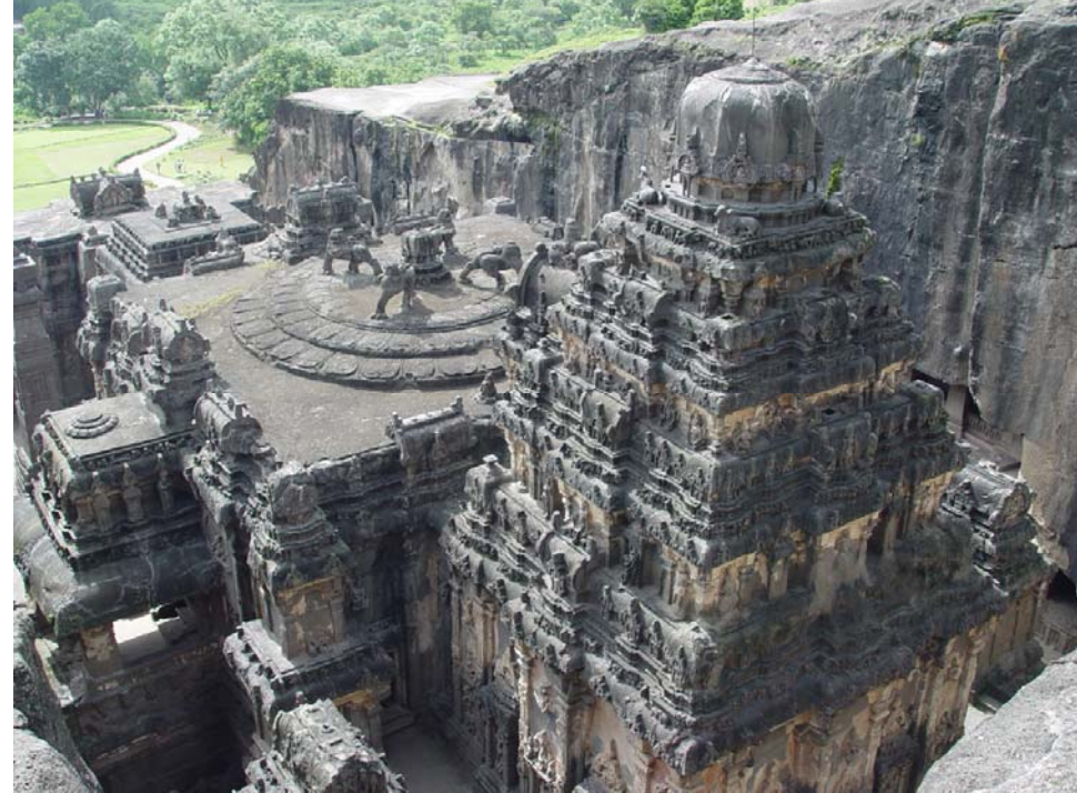
(Figure 55) Front view (left) and view from the back (right) of cave 16 (Kailasa Temple) after cleaning Photos taken in August 2004. The surfaces of rocks are already turning black due to air pollution and growth of microorganisms.