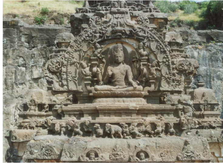
(Figure 56) Cave 16 During cleaning work (left) and after completion (right)