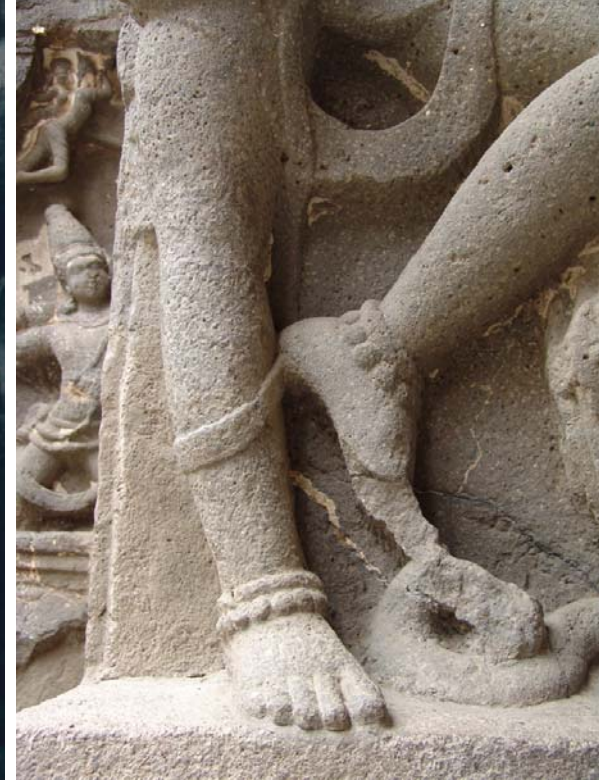
(Figure 58) Restoration and reconstruction of sculptures cave 16 of Ellora historic site