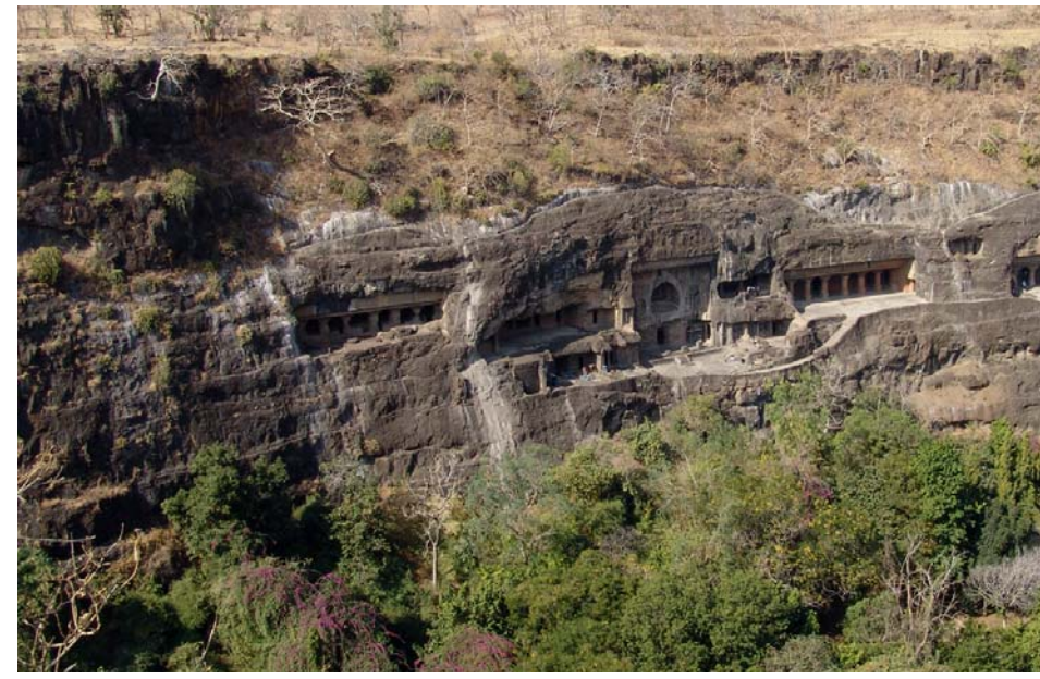
(Figure 12) View around caves 24-28 where the natural rock surface can be seen