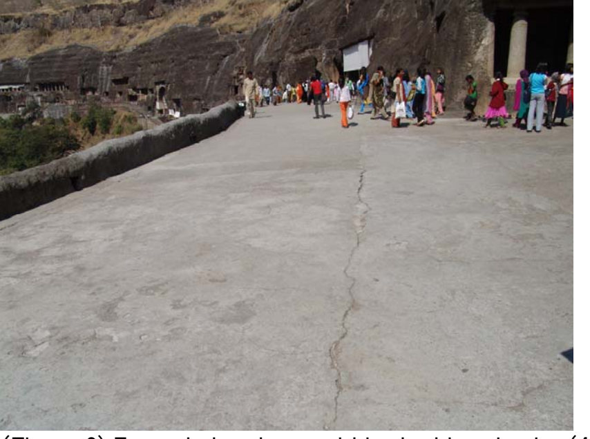
(Figure 6) Expanded pathway within the historic site (4) In front of cave 1