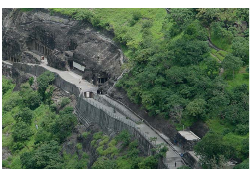
(Figure 11) Retaining wall that resembles a defensive wall