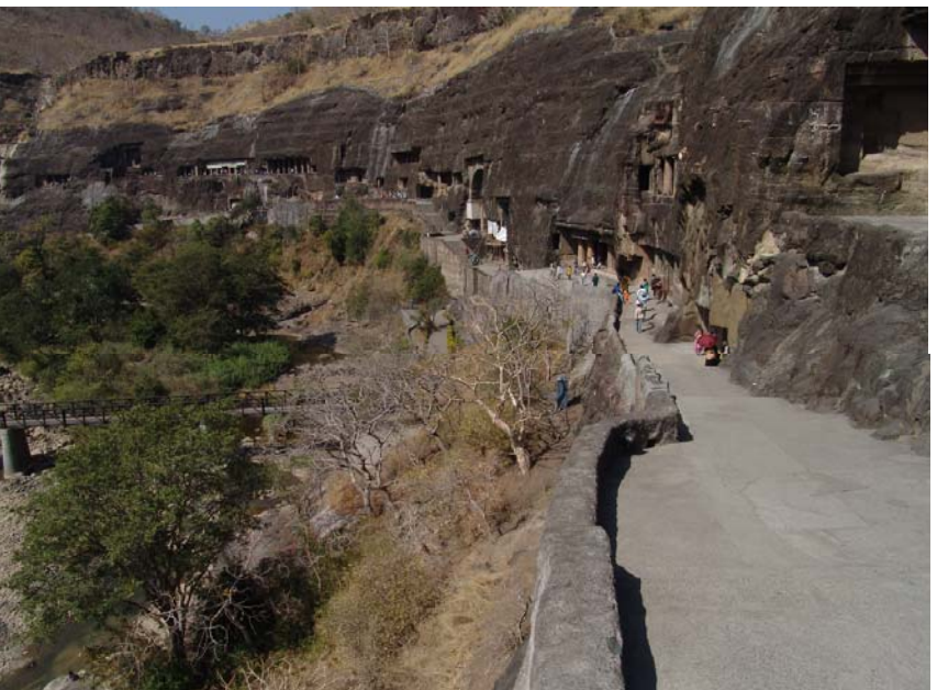
(Figure 8) Expanded pathway within the historic site (6) In front of cave 3-7