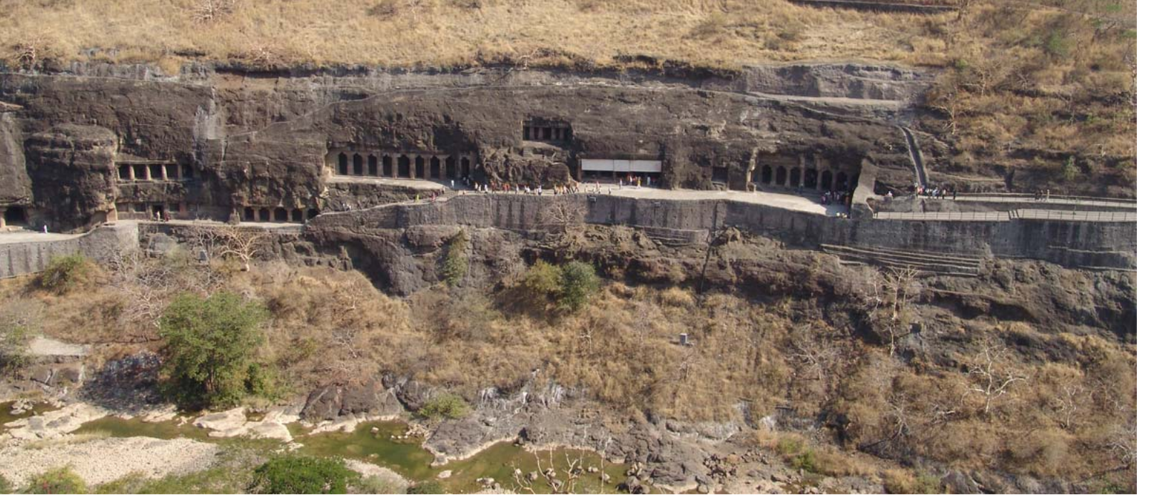
(Figure 10) High concrete-made retaining wall which has appeared as a result of the pathway expansion