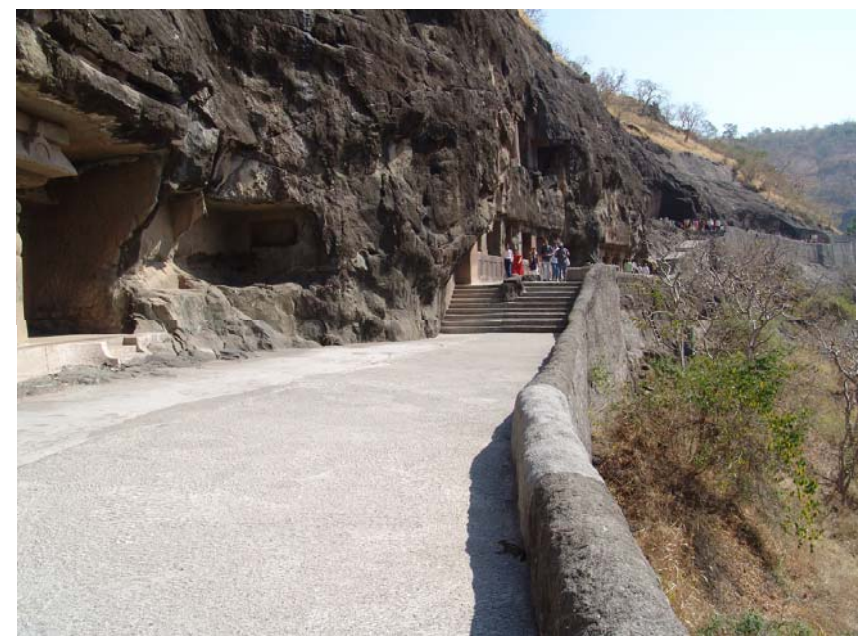
(Figure 9) Expanded pathway within the historic site (7) In front of cave 7