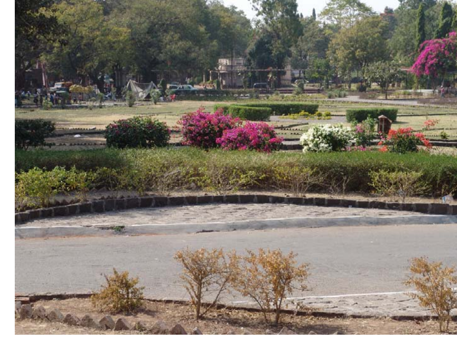
(Figure 69) Landscaping and beautification of the area in front of cave 16 at Ellora historic site