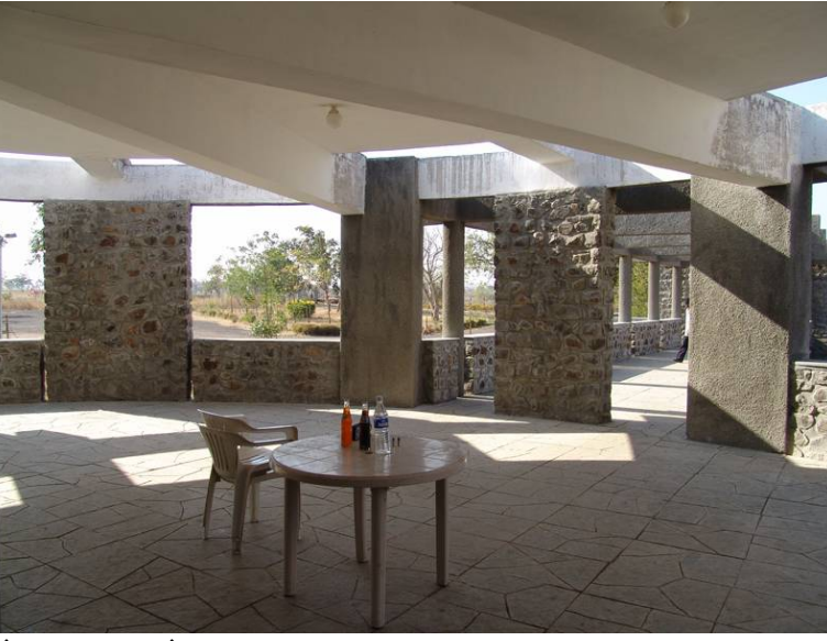
(Figure 71) Restaurant built at Viewpoint

(Figure 70) Panoramic view of the historic site seen from Ajanta Viewpoint (above) and the observatory facility (below)