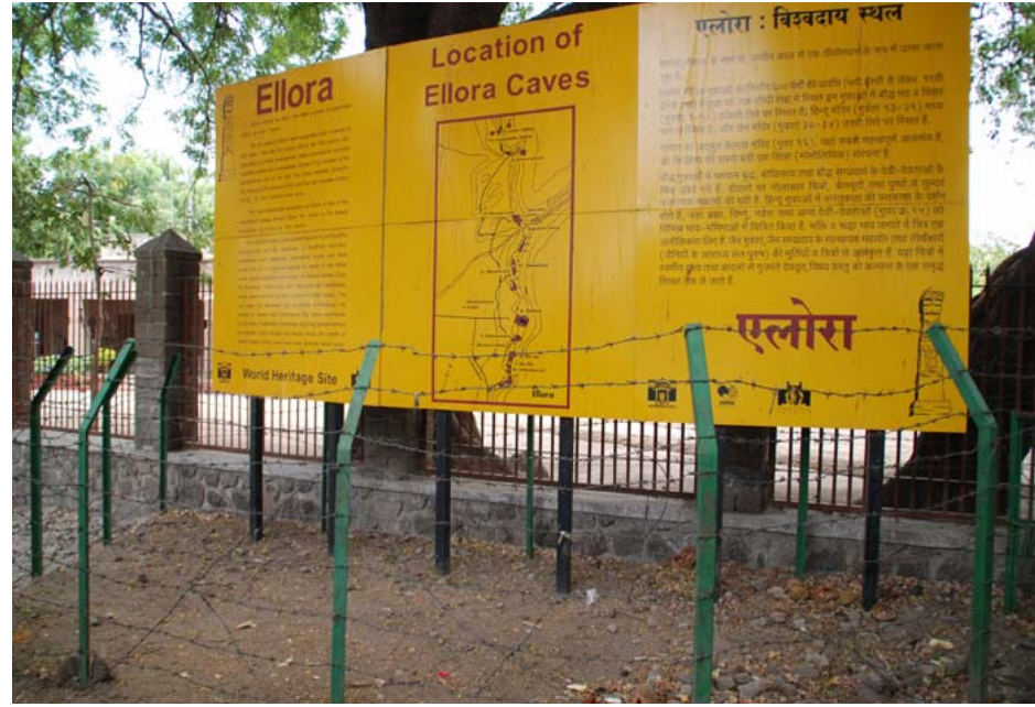
(Figure 76) Information board at the entrance of Ellora historic site