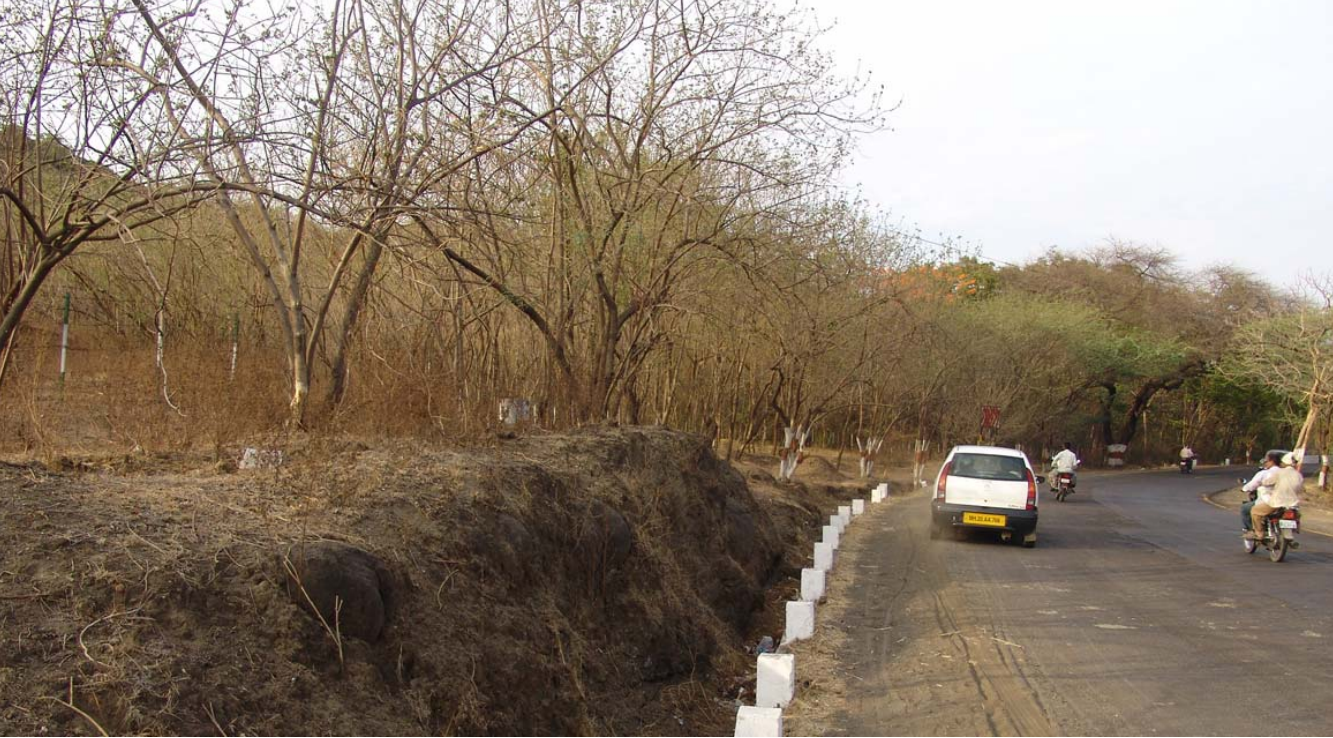
(Figure 74) Afforested area on the side of a road leading to Ellora historic site

This area is designated as wild bird sanctuary.