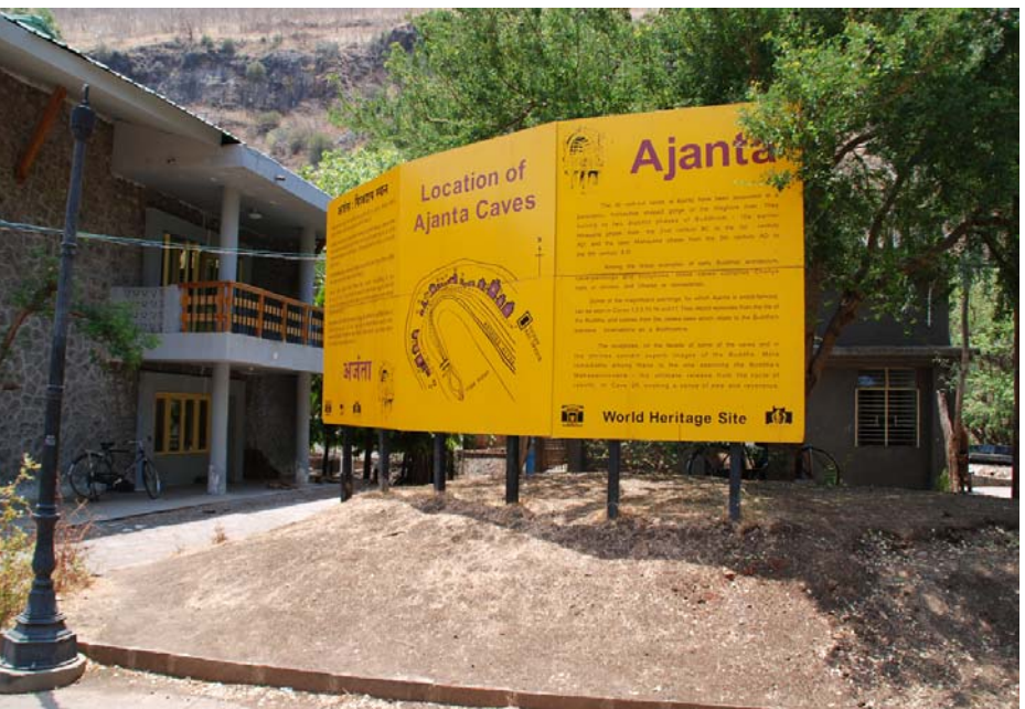
(Figure 75) Information board at the entrance of Ajanta historic site