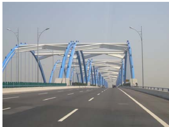
Yellow Rive Large Bridge