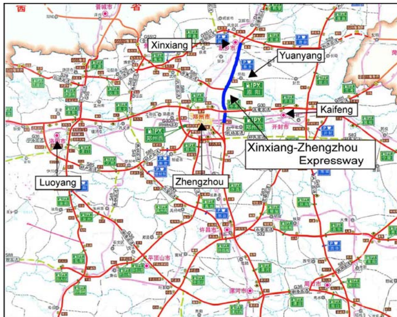
Figure 1 Location of Project Site

The objectives of the project are to enhance the transport effectiveness and improve the traffic conditions along the Xinxiang-Zhengzhou corridor, and to improve the transport efficiency with neighboring regions, by constructing a 80 km expressway between Xinxiang and Zhengzhou in Henan Province, a section between Beijing and Zhuhai, which is one of “the high priority 2 vertical-2 horizontal-3 routes” among NTHS in China, thereby contributing to improvement of the investment environment and promotion of the economic development along the corridor . The location of the project site is shown in Figure 1.