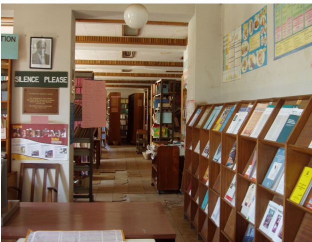
Kenya: KEMRI Library