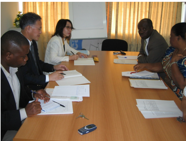
Ghana: Discussion at the WHO Ghana Office