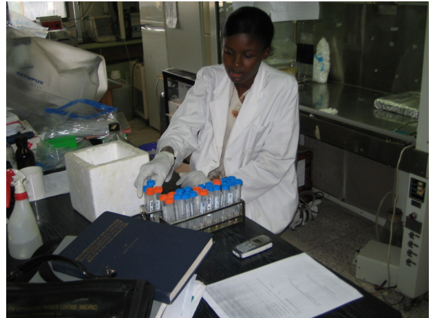
Ghana: Blood testing at the Virology Unit, NMIMR