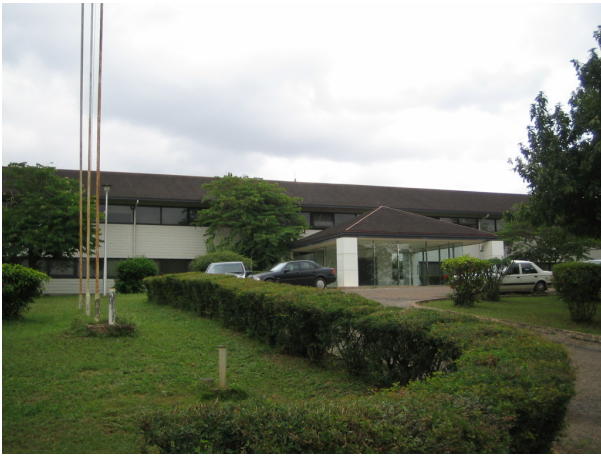
Ghana: Appearance of the NMIMR