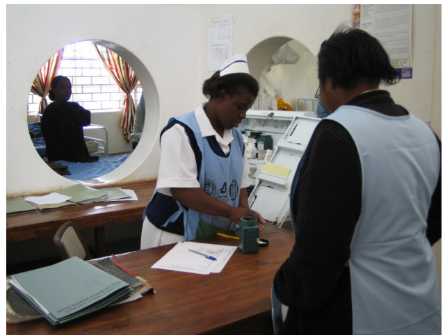
Zambia: Chelestone Health Centre, Lusaka District (One of several health centers supported by the JICA HIV/AIDS and TB Control Project for external quality assurance of TB microscopy)