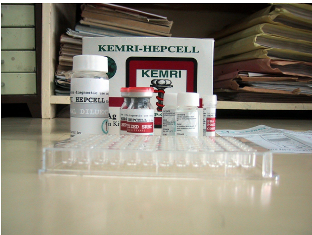
Kenya: HEPCELL II, diagnosis kit for hepatitis B, produced by the KEMRI