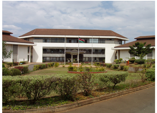
Kenya: Appearance of the KEMRI