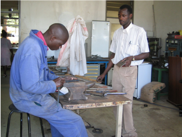
Kenya: Repair of medical equipment in the Maintenance and Engineering Division, KEMRI