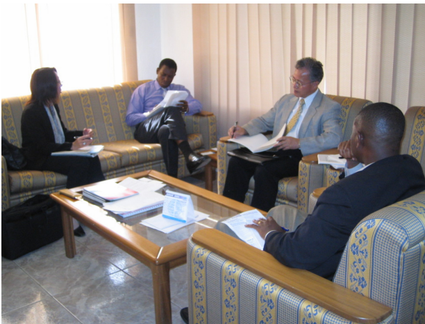
Ghana: Discussion at the Ministry of Education