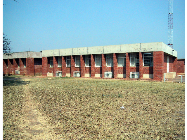
Zambia: Establishment of the Virology Laboratory and Tuberculosis Laboratory, UTH