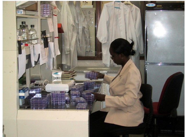
Zambia: Blood testing at the Virology Laboratory, UTH