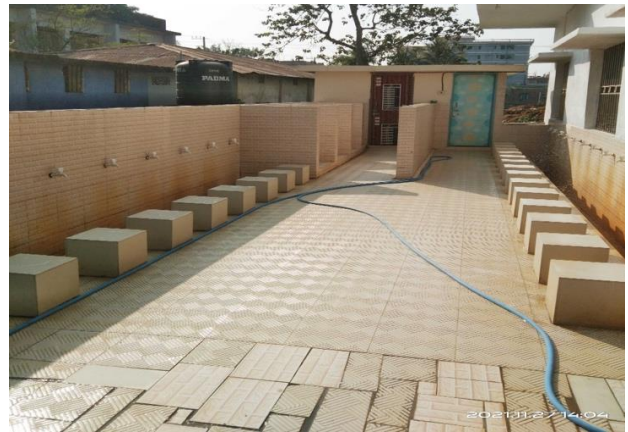
Ablution Points of the Mosque