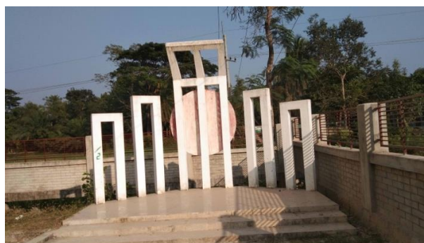
Shohid Minar (Martyr Monument)