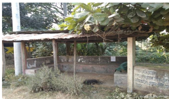
Passenger shed of a bus stop