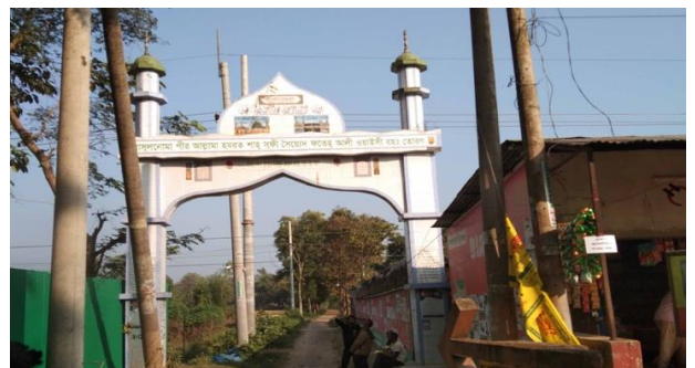
Gate of Madrasah (CPRs)