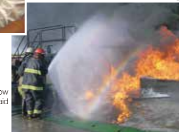
Course participants learning know-how of emergency aid