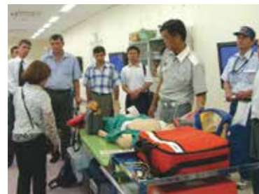
Course participants learning rescue techniques in disaster medical care training

The Great Hanshin-Awaji Earthquake, which occurred on January 17, 1995, left extensive damage mainly in Southern Hyogo Prefecture. The earthquake was the most monstrous disaster on record, with casualties of approximately 6,400, and the total amount of damage reaching 10 trillion yen. The damaged area has succeeded in a quick recovery with generous and broad support from around the world. The affected area has made all-out efforts in restoration, and is still actively promoting community building focusing on disaster prevention/reduction based on the experiences and lessons learned from the disaster.