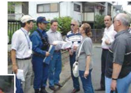
Course participants conducting Town-Watching for Hazard Mapping practice