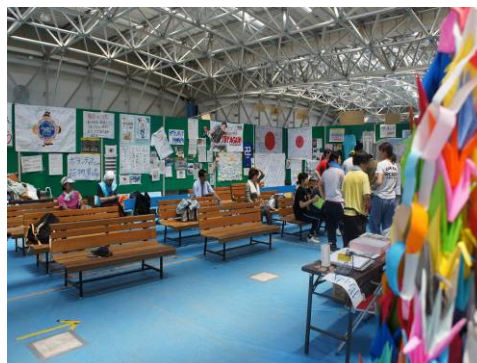
Picture 8 Inside of Shichigahama Town Volunteer Center

The indoor athletic field is used as volunteer center in Shichigahama Town. The center is used effectively and divided to storage of donated bicycles and other aid supplies, meeting and orientating room for the volunteers etc. Handwritten posters and friendly volunteers brightened the volunteer center.