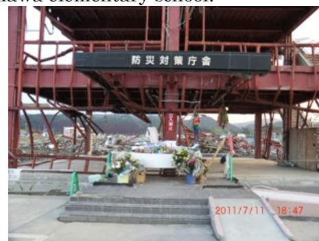
Picture 1 Minami Sanriku City disaster management office

At the remaining of Minami Sanriku City disaster management office, many flowers were offered as a memorial to 4 months anniversary of earthquake and tsunami. Additionally, the Study team found the offerings and flowers at the Okawa elementary school.