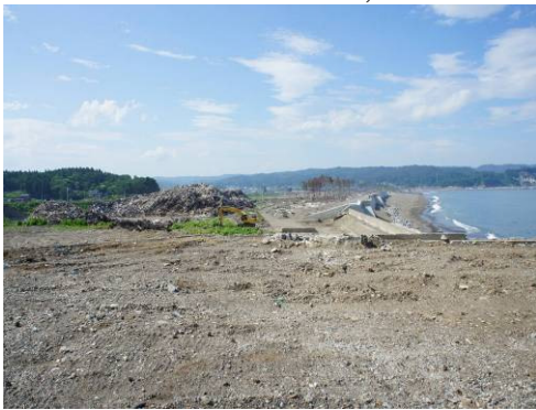
Picture 2 Taro region after the debris removal

In some affected area, the debris removal has been conducted rapidly. On the other hand, there are some areas where the debris removal has not been forwarded. The gap on the progress of debris removal at each area could be occurred by the scale of damage, the city budget and the degree of attention to the areas, etc.