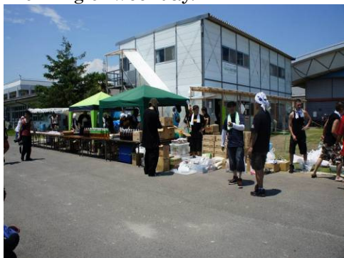
Picture 7 Meal preparation at Shichigahama Town Volunteer Center

The meal for affected people was prepared at the Shichigahama Town volunteer center. Many volunteers came to the center by tour bus even in the morning of weekday.