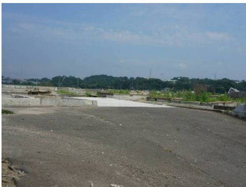
Picture 3 Shichigahama Town of Miyagi Prefecture after the debris removal