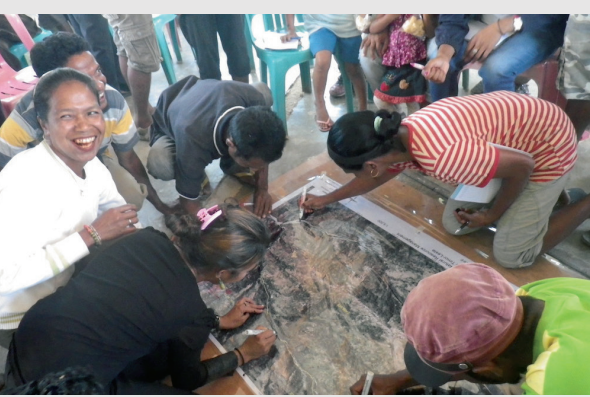
Aerial photo of a forest conservation plan being discussed with the participation of local residents, Timor-Leste.

In order to continue the project and expand the project model nationwide, JICA will secure international funding from sources such as the Green Climate Fund (GCF), promote regional cooperation, and collaborate with other donors, private companies, NGOs, and other partners.