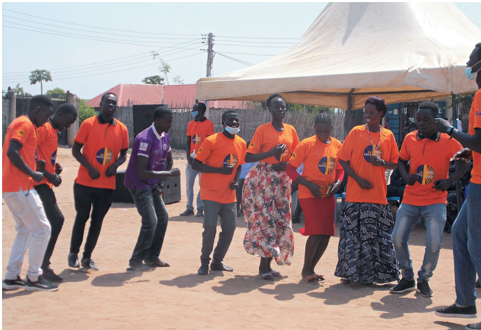
Event to Commemorate the International Day for the Elimination of Violence Against Women on November 25