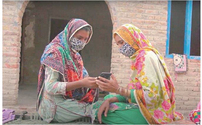
Women using smartphones to market their handicrafts

In Sindh province, Pakistan, many female home based workers known as the “invisible workers” produce and sell handicrafts and others to generate income. However, many markets to sell the products were shut down due to impact of COVID-19 in 2020. In response JICA provided trainings on digital marketing and the use of SNS to empower workers to sell their products online to support maintain their economic self-reliance.