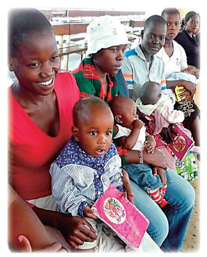
MCH clinic in Nyanza Provincial Hospital, Kisumu, Kenya