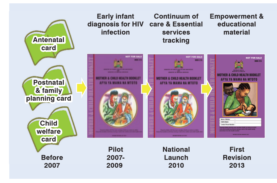
▲ Figure 1. History of MCH Booklets developed in Kenya

The recent study reported that ownership of the MCH Booklet positively associated with the higher health knowledge and proper healthseeking behavior among mothers. In the study, the sampling frame composed of a total of 11,906 children aged 12-23 months in 64 community units (CUs) of four districts of Nyanza province (Siaya, Ugenya, Gem and Kisumu West) was prepared. Of them, 2,560 children were aged 12-23 months were selected by using simple random sampling method. Of their mothers (=2,560), 2,051 were interviewed by using a structured questionnaire on their socio-economic status and ownership of the MCH Booklet. Most mothers (92%) had the MCH Booklet. The factors identified as significantly related to the ownership of the MCH Booklet were child's sex (male), caregivers'