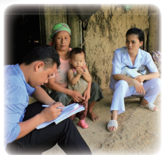
An interview with a mother in a village in Dien Bien province

Therefore, contribution of MCH Handbook intervention to the increase in knowledge of antenatal care needs is likely to have been limited. On the other hand, the proportion of pregnant women who received three or more antenatal care visits significantly increased from 67.5% (pre-intervention) to 92.2% (post-intervention) ( P < 0.001 ). This implies that the MCH handbook is likely to have effectively reminded and encouraged pregnant women to ensure three or more antenatal care visits during pregnancy, by making their antenatal care seeking attitude more proactive. Yet, recording of results of antenatal care checkups in the MCH Handbook remained limited (66.3%).