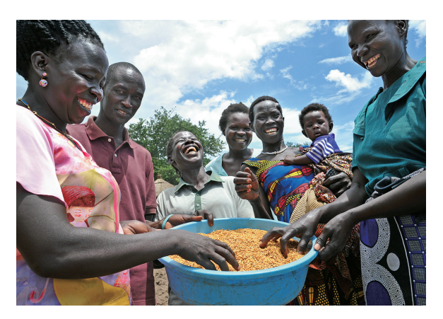
Refugees learning rice farming techniques in a rural village in Uganda

The Ugandan government and JICA created tools for improving the development planning capacity of local government officials, and improved livelihood through increased agricultural production for local residents and refugees, including the vulnerable. These are evidence-based and bottom-up development planning tools which assess the priorities of projects proposed by local villages based on objective criteria. They also reflect voices from various people on project proposals.