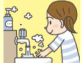
By INOUE Kimidori

( https://www.jica.go.jp/english/our_work/thematic_issues/water/handwashing/index.html )