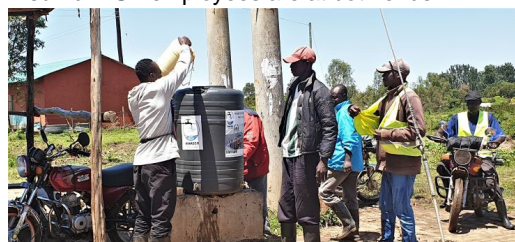
Installing handwashing facilities in motorcycle waiting areas called Bodaboda