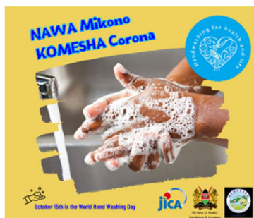
Handwashing poster for Nakuru WSP. "Wash your hands, stop COVID-19" in Swahili.