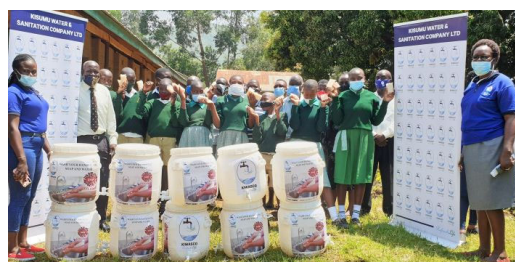
Awareness-raising activities at Kianja elementary school and donation of handwashing facilities. Kisumu WSP employees are at both ends.