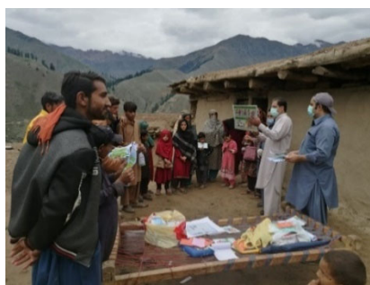
Raising awareness of COVID-19 prevention to residents who come for vaccinations