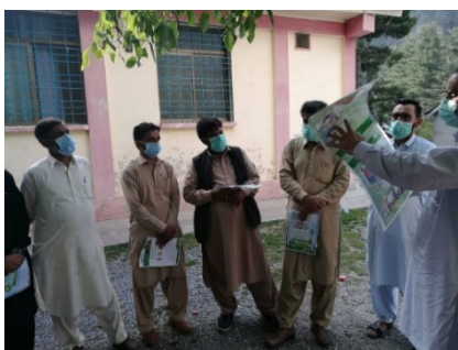
Brief orientation to immunization workers on infection prevention before outreach immunization activities