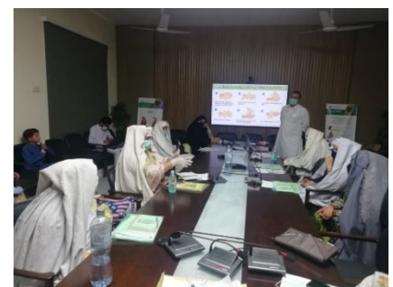
Training for maternal and child health workers in the prevention of infectious diseases (how to wash hands, wear masks and gloves, disinfect materials and equipment)

(Ms. Omura, "Project for Strengthening Routine Immunization System in Primary Health Care Settings" in Pakistan)