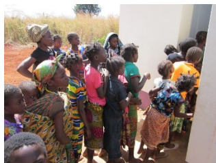
Girls learning how to use a toilet in a school in Mozambique

Promote the Toilet Revolution in Developing Countries! Let's rethink the importance of the toilet