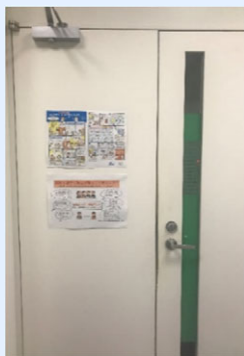
Hand-washing poster on the door of the office at JICA Headquarters (above)

Languages available: English, French, Spanish, Cambodian, Tetum, Swahili, Sinhalese, Tamil, Madagascar, Pidgin, Thai, Amharic, Arabic, Russian, Kyrgyz, Hislama, Divehin, Hindi, Bengali, Nepali, Mongolian, Dari, Indonesian, Ukrainian