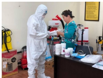
Teaching waste collection workers how to properly wear a mask and gloves