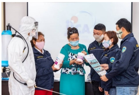
Teaching people how to properly wash their hands and wear a mask