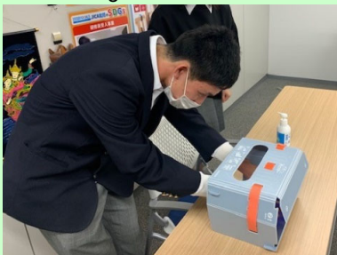
A visitor using the handwashing checker

We at the JICA Hokuriku Center tried out the handwashing checker when we found the information from “JICA handwashing for health and life campaign” secretariat, which was posted on the JICA internal website on September 7. The initial purpose of using the handwashing checker was to raise awareness of handwashing for our health management in the Hokuriku Center. However, having used it, we decided to make it available to visitors, so we set it up at the entrance of the Hokuriku Center and announced it on our Facebook ( click here for more information )!