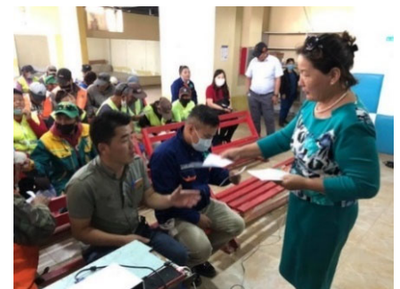
Seminar to garbage collectors

Note: In Ulaanbaatar City, as of August 19, 2020, when the training was conducted, the number of COVID-19 cases returning from abroad was 298, but there were no infected cases in the city.