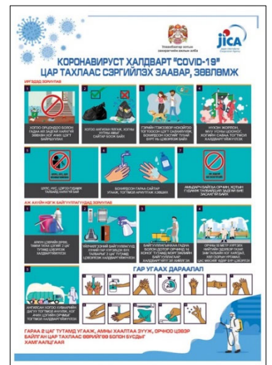
Posters for the public and businesses

In Mongolia, lockdown measures are currently in place due to the confirmation of the citywide outbreak of COVID-19, but waste is still being generated daily and the participants continue to work in the field. We hope strongly that the knowledge gained from this training will be fully utilized to ensure safe disposal of waste, then infections are kept to minimum.