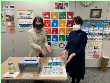
Staff of JICA Hokuriku and the handwashing checker

Since September 2020, JICA Global Environment Department has been offering lending handwashing checker which you can check whether you have washed your hands properly within JICA. JICA Hokuriku Center reports on the use of the kit in this article.